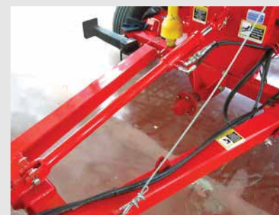
Hydraulic height adjustment.