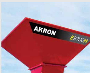
Extra-large grain hopper.