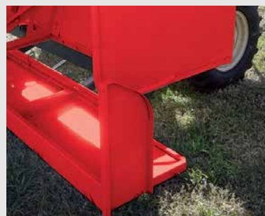
Hydraulically operated pan.