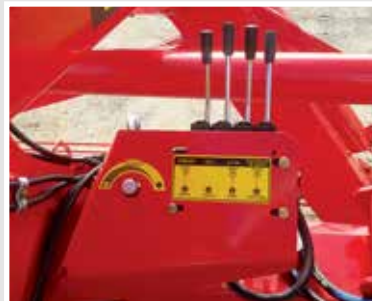
Independent hydraulic controls. Speed Control Valve.