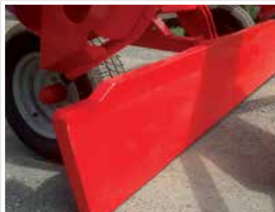
Grain Pusher. It ensures a better end of bag.