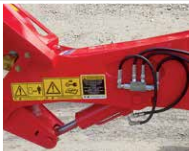
Height adjustment through hydraulic cylinder.

AKRON may change specifications and product designs in this or other brochure at any time, without previous notice. Pictures shown are for illustration purposes only.