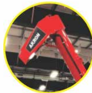
Hydraulic Movable Spout.