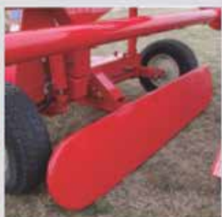
Grain Pusher It ensures an optimized way of ending the bag.