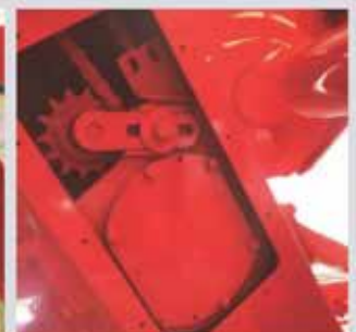
New transmission system.