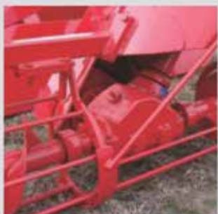
Bottom Angular Gearbox.

AKRON may change specifications and product designs in this or other brochure at any time, without previous notice. Pictures shown are for illustration purposes only.