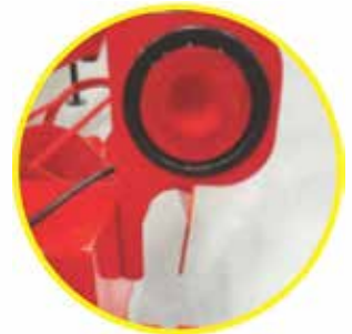
Led Running Lights.