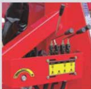
Independent Hydraulic Controls. Speed Control Valve.