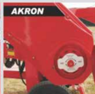
Roll transmission achieved through a sturdy reduction gearbox and only one chain.