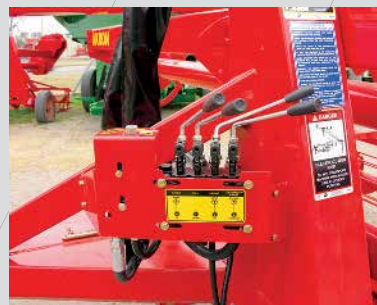
Independent Hydraulic Controls. Speed Control Valve.