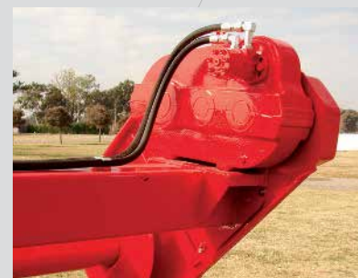
Roller transmission achieved through a sturdy reduction gearbox and only one chain.