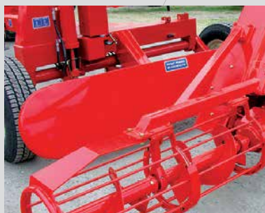
Grain Pusher. It ensures an optimized way of ending the bag.