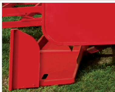
Hydraulically operated pan.