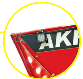
Led work lights.

GTT4010 - 10-foot Grain Bagger our hydraulic pan offers the simplest and fastest way to load bags!