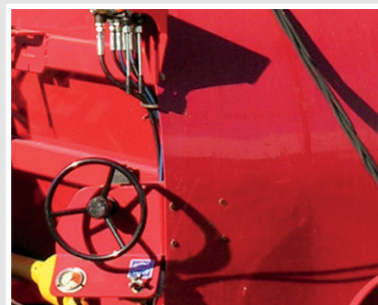
Precise brake system.