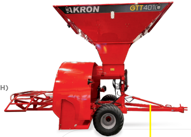
Hydraulic height adjustment (optional).