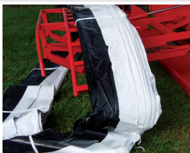
Best bag positioning with Easy Lift™

AKRON may change specifications and product designs in this or other brochure at any time, without previous notice. Pictures shown are for illustration purposes only.