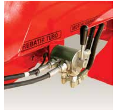
Selector valve / Air drill.