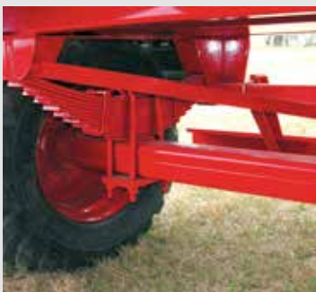
Extra reinforced axles.

Rosario de Santa Fe 2256 X2400EFN San Francisco CBA, Argentina Tel/Fax: + 54 3564 498502 export@akron.com.ar www.akron.com.ar