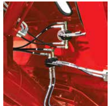
Selector valve / Two augers.