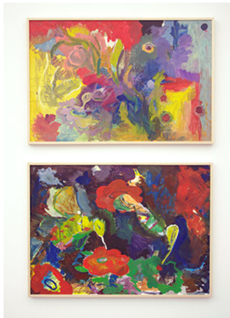
Adrienne Rubenstein Pollination 1 (2014) (top) and Pollination 2 (2014) (bottom) oil on canvas 24 x 36 (top) and 26 x 36 (bottom)

spread in these dog-days; the works' cheeky irreverence is a reprieve from the sardonic murmurs so often associated with the future of our species. Sally Saul's painted ceramic sculptures