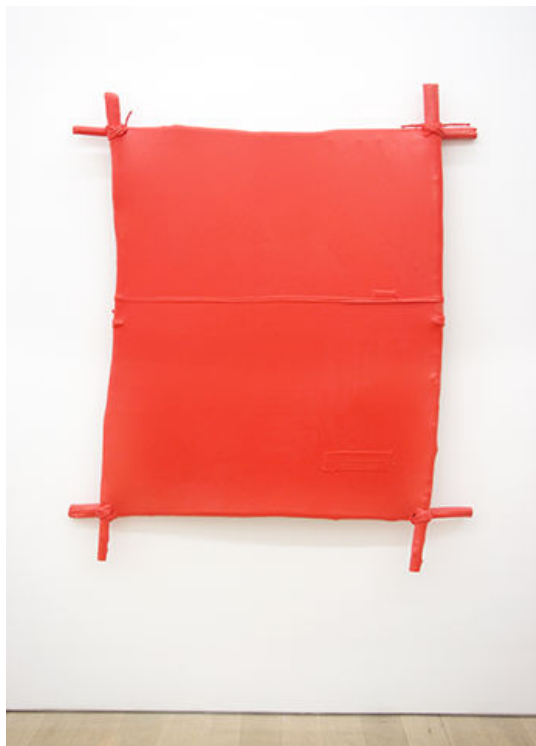
Al Freeman modern Stone Age (2014) New Jersey Branches, manilla rope, drop cloth, gesso, oil paint 71 x 60 x 4.5

From the press release: CANADA is located at 333 Broome Street between Chrystie Street and Bowery. Our summer hours are 11:00 AM to 6:00 PM Tuesday through Friday.