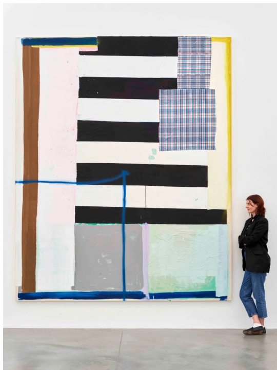
New York-based artist Sadie Laska © Newport Street Gallery

infrastructure to make it possible." Saville creates her colour field canvases by applying up to 30 layers of paint and then sanding them back to achieve a flawless, shimmering surface.