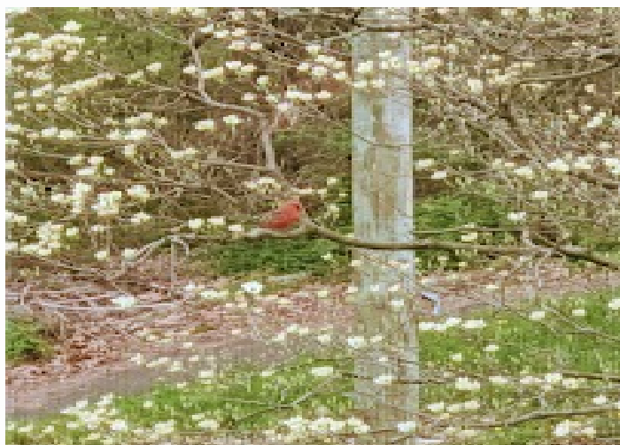
Bo White Gardens