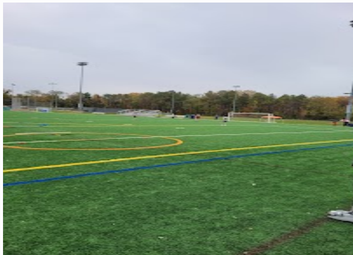
Pine Ridge Park