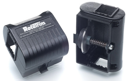
DTHEAD (Complete Cutting Head)