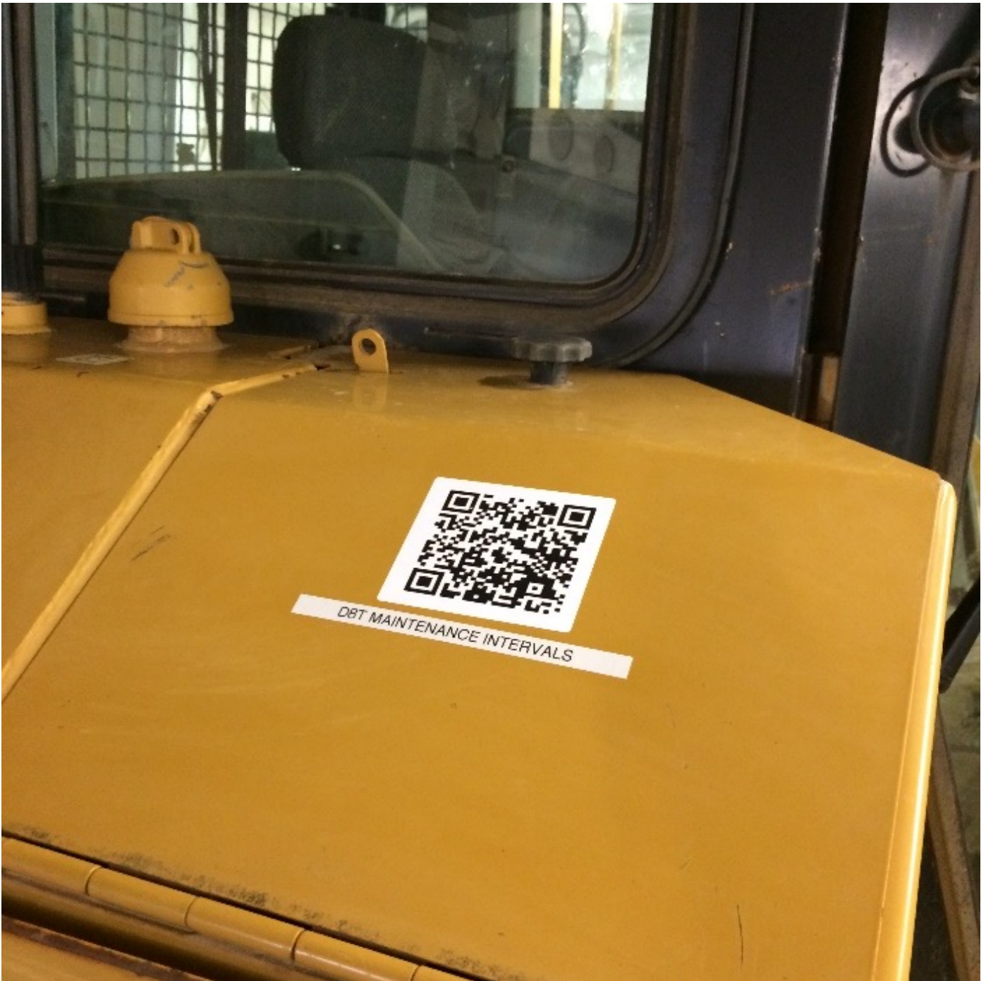
The QR codes throughout Henkels & McCoy's fleet provide instant smartphone access of key construction equipment information to service technicians and operators, including a dozer's maintenance intervals.