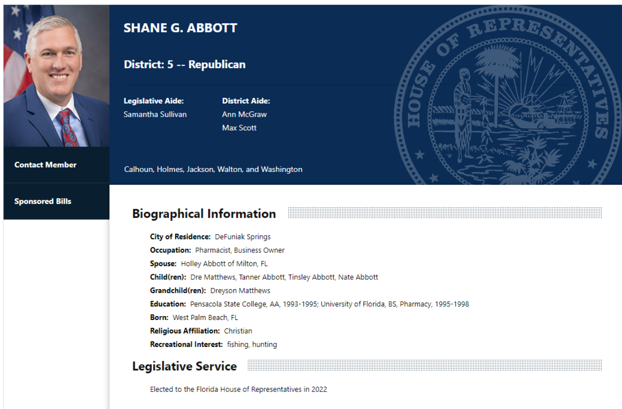
Photo is linked to The Florida House District Maps page. Clicking any of the members will take you to the individual member’s profile (as seen above)