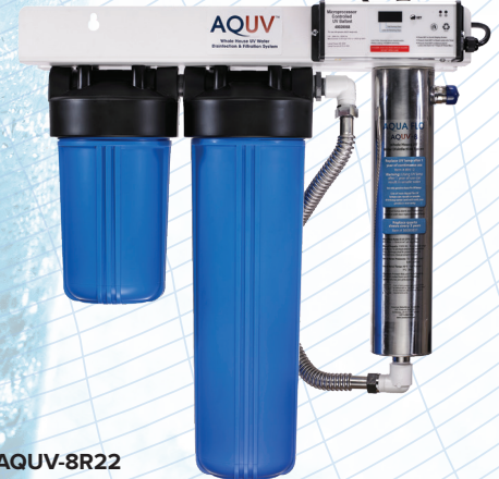
AQUV-8R22 AQUV-12R22 AQUV-20R22