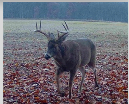
PHOTOS TAKEN ON GAME CAM