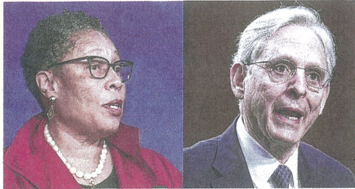
HUD and attorney general nominees Marcia Fudge and Merrick Garland,

Those who push for equity have hidden these crucial differences for a reason. They aren't merely unpopular; they challenge America's bedrock principle that people should be treated equally and judged as indi-