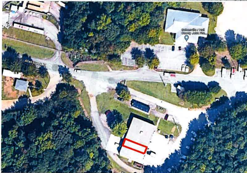
Approximate location of leased area.