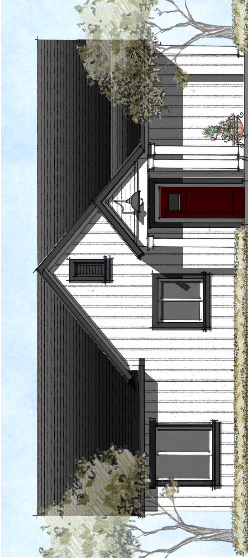
PLAN 3 FARMHOUSE

NOT FOR REGULATORY APPROVAL, PERMITTING, OR CONSTRUCTION