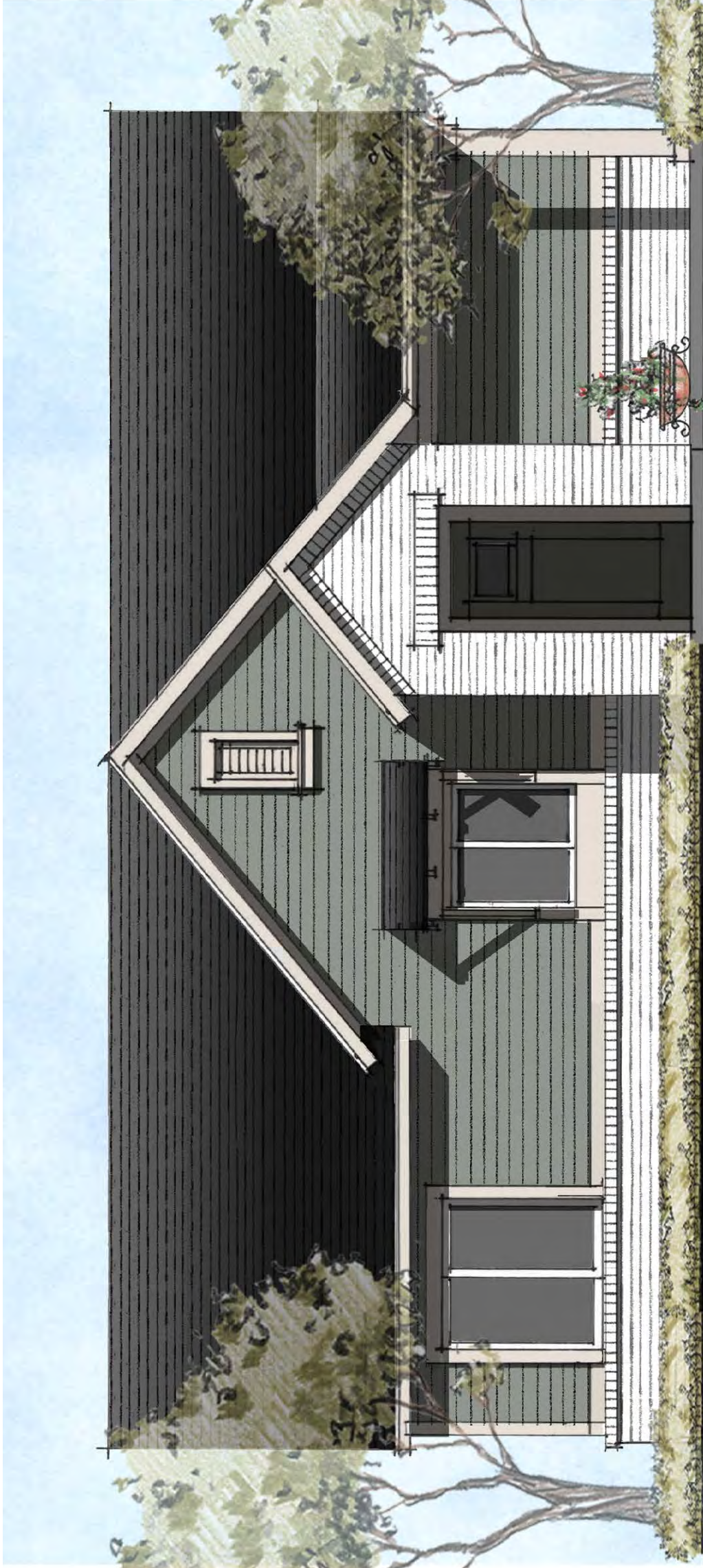
PLAN 3 FARMHOUSE v. 2

NOT FOR REGULATORY APPROVAL, PERMITTING, OR CONSTRUCTION