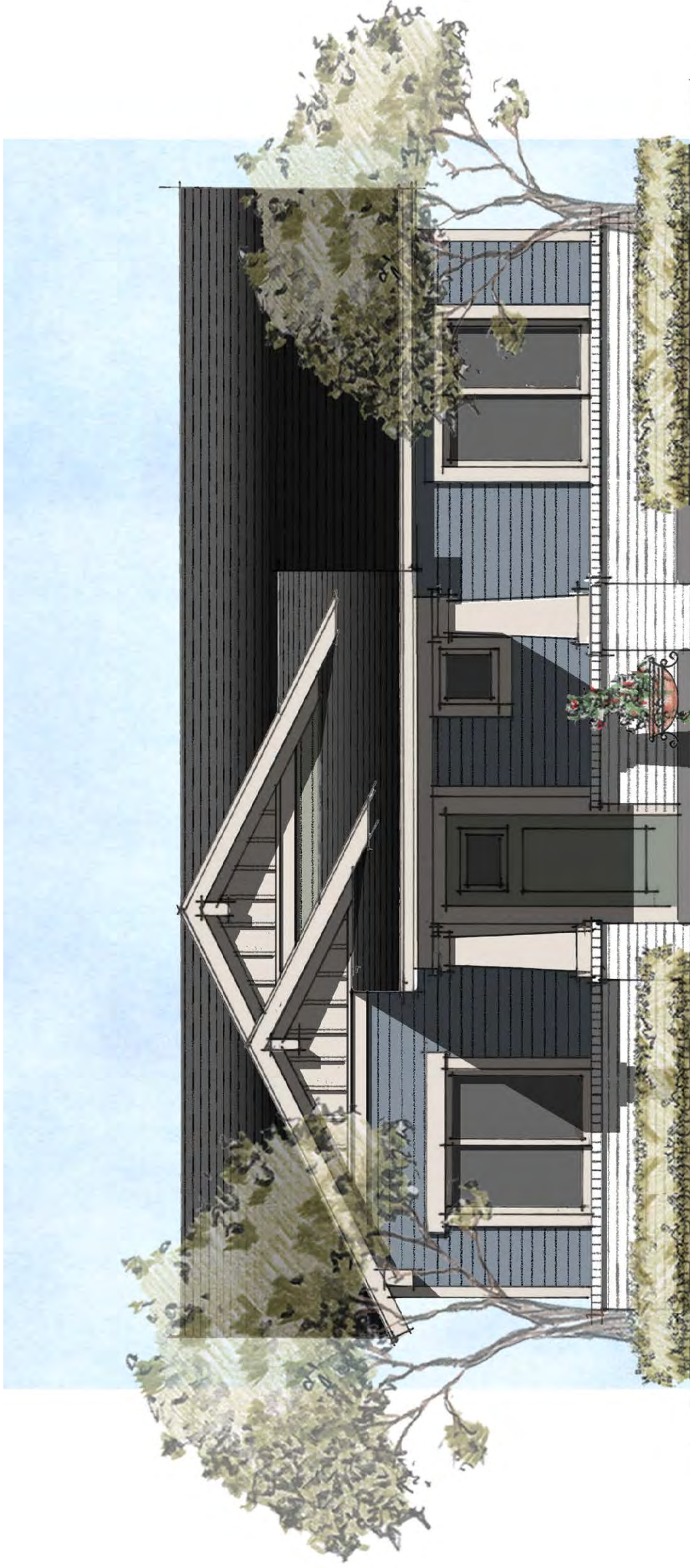
PLAN 2 BUNGALOW

NOT FOR REGULATORY APPROVAL, PERMITTING, OR CONSTRUCTION