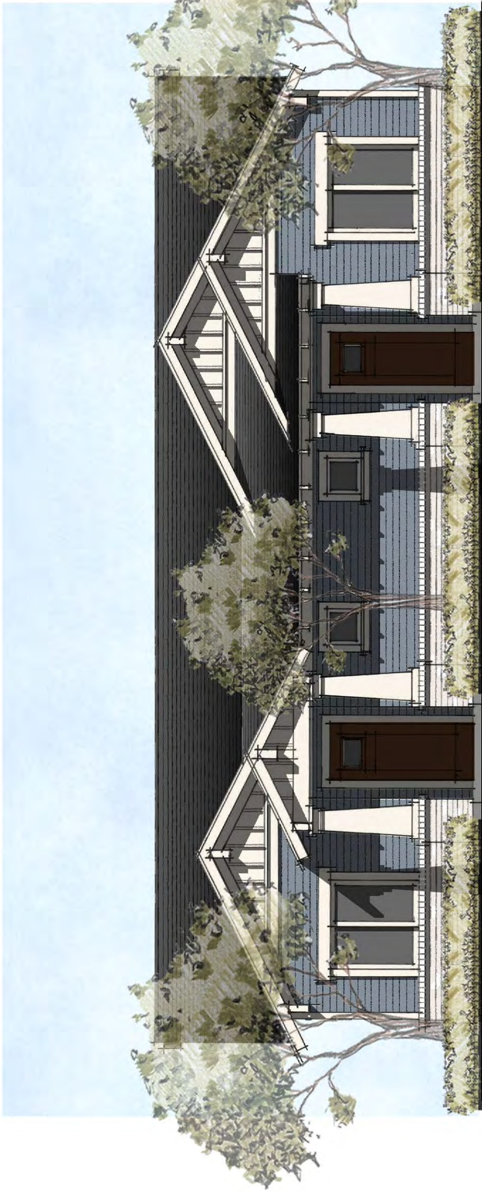
PLAN 1 BUNGALOW

NOT FOR REGULATORY APPROVAL, PERMITTING, OR CONSTRUCTION