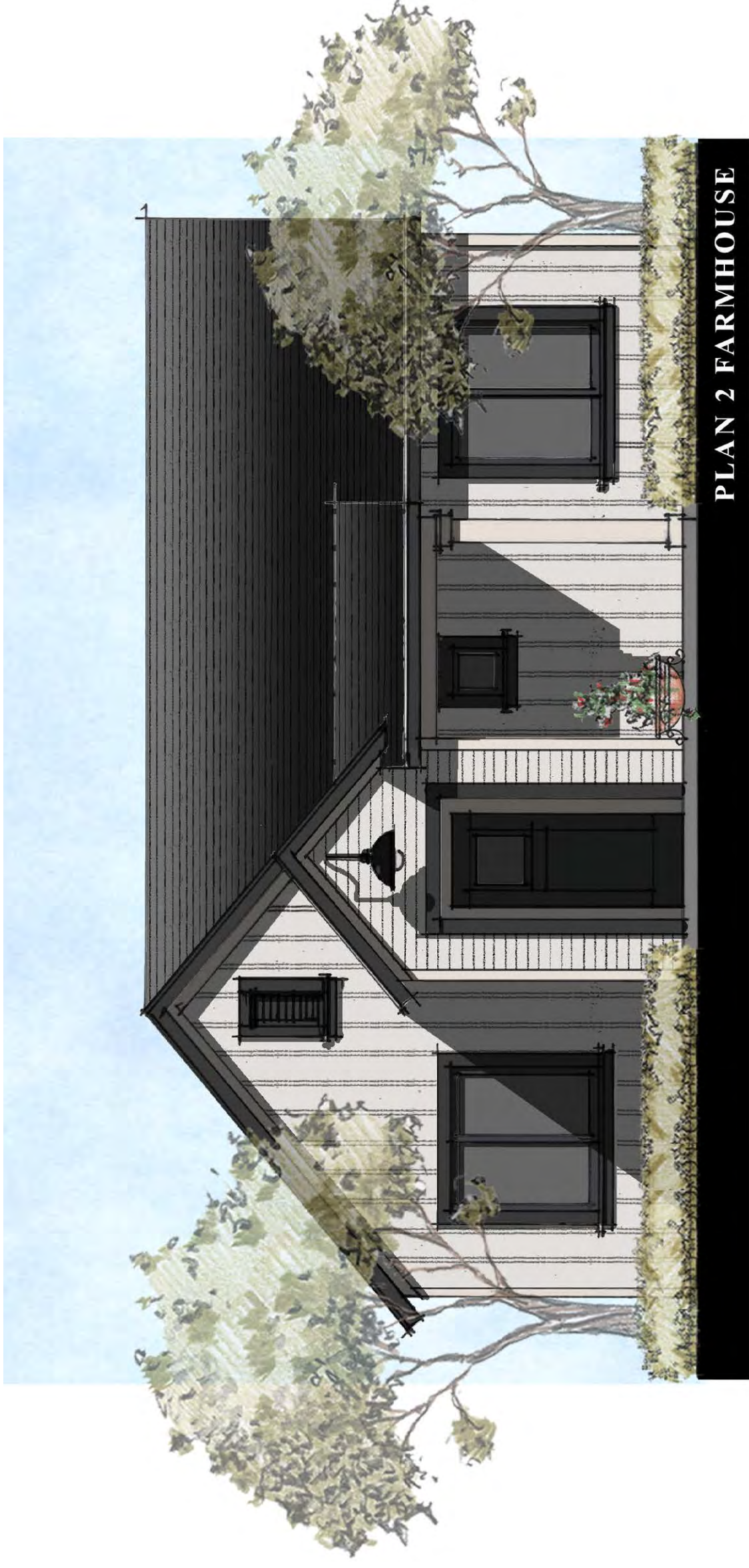
PLAN 2 FARMHOUSE

NOT FOR REGULATORY APPROVAL, PERMITTING, OR CONSTRUCTION