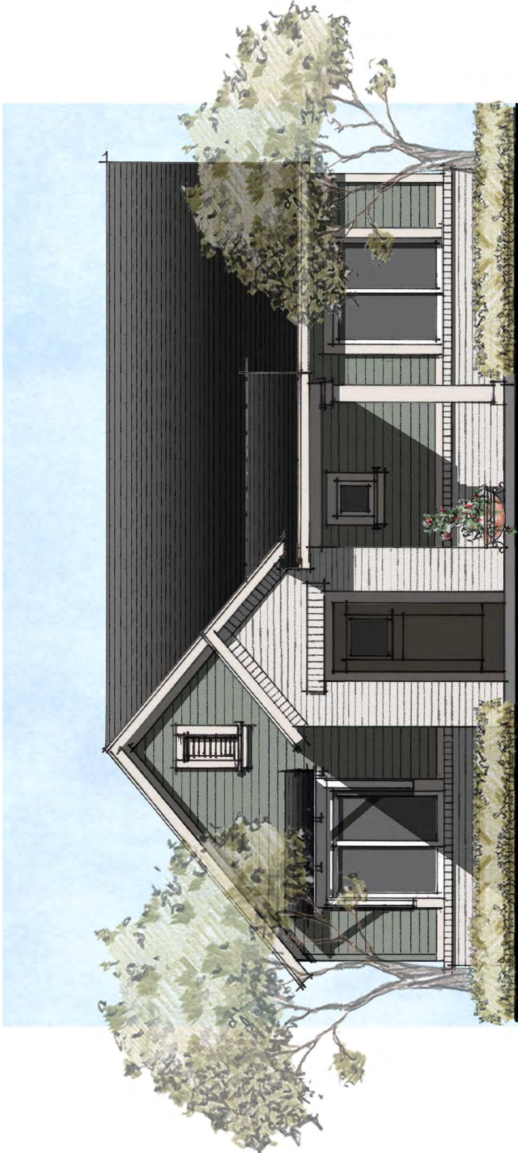
PLAN 2 FARMHOUSE V2

NOT FOR REGULATORY APPROVAL, PERMITTING, OR CONSTRUCTION