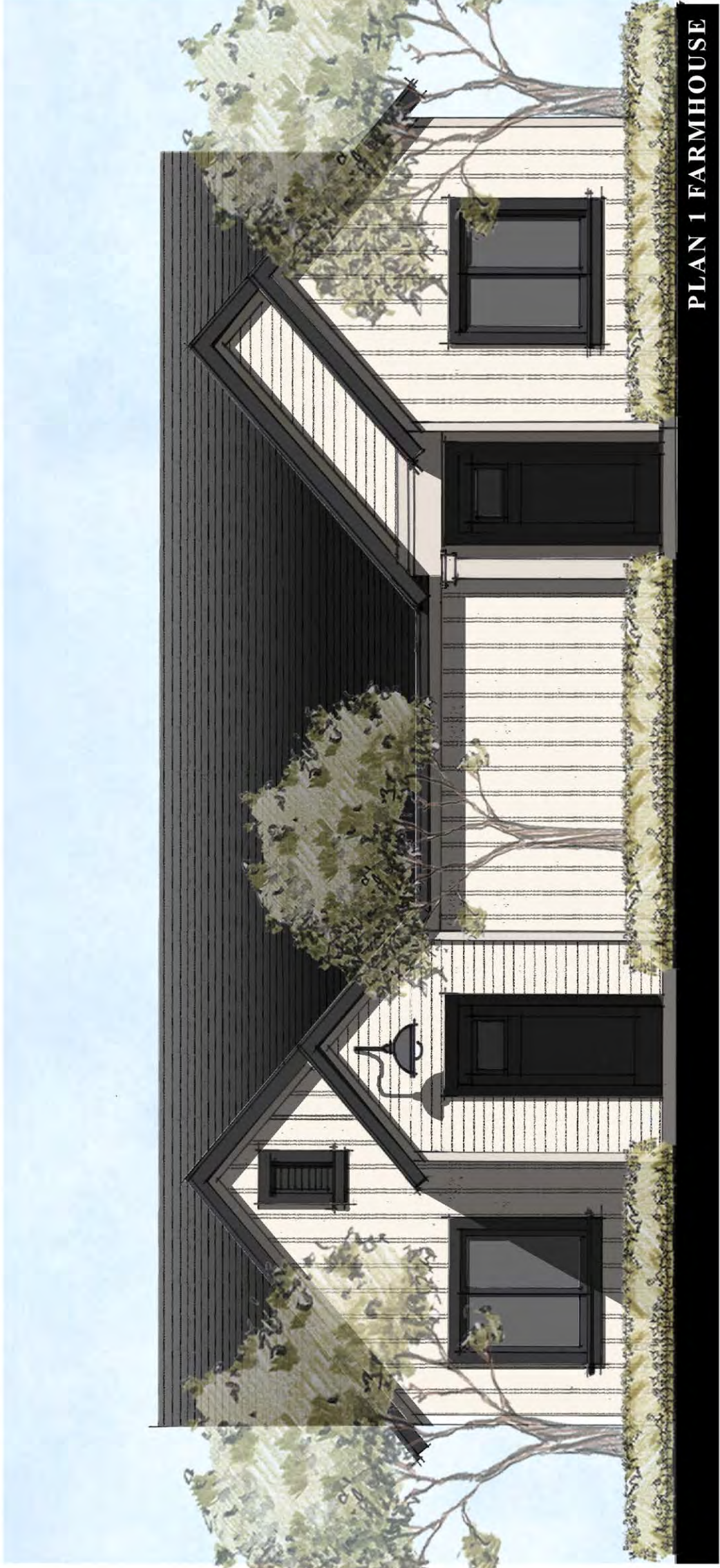
PLAN 1 FARMHOUSE

NOT FOR REGULATORY APPROVAL, PERMITTING, OR CONSTRUCTION