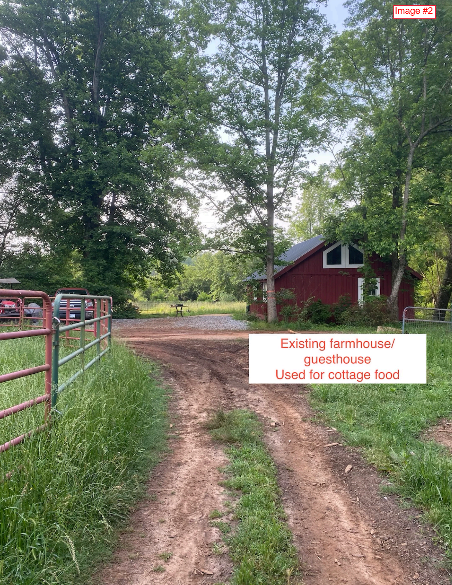
Existing farmhouse/ guesthouse Used for cottage food