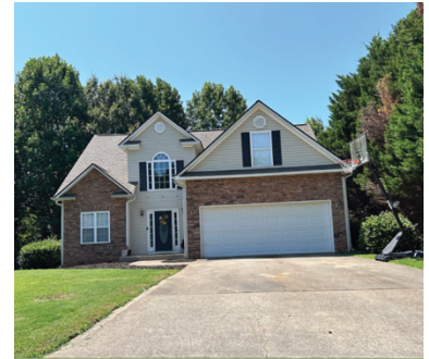
Illustrative images for proposed community

DLBP LLC is a Delaware limited liability company. Registered for business in the State of Georgia.