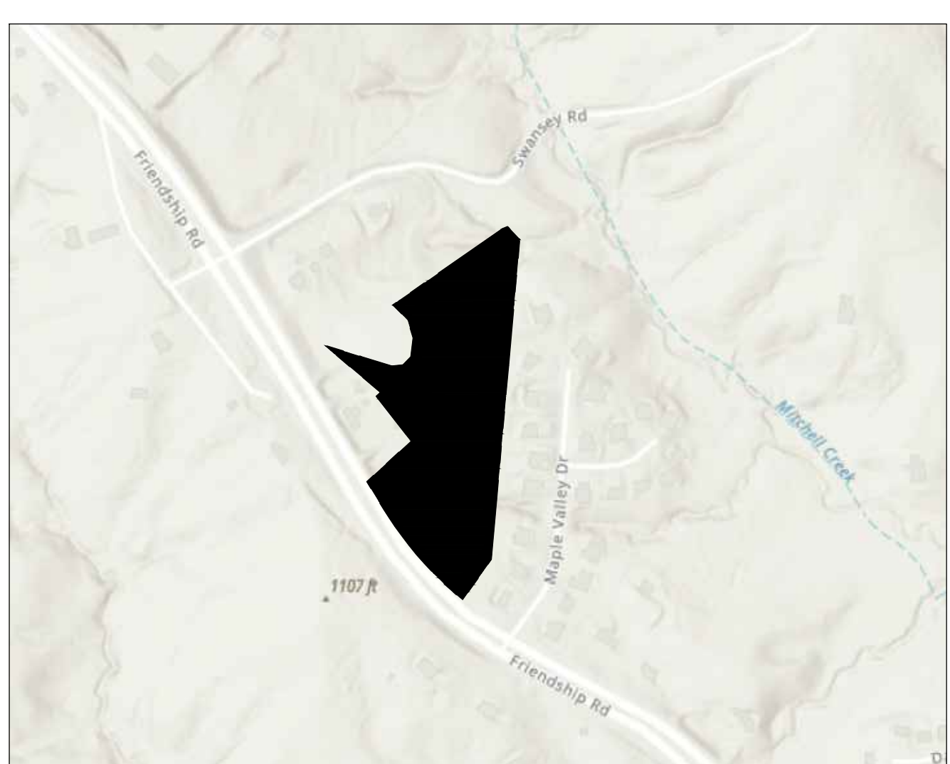
VICINITY MAP SCALE=N.T.S.

DEVELOPMENT SUMMARY 1. TOTAL PROPERTY ACREAGE = ±10.127 AC. 2. TOTAL NUMBER OF LOTS = 22 3. EXISTING ZONING: AR-111 / PROPOSED ZONING: PRD (WITH EXCEPTIONS) 4. PROPOSED ZONING PARCEL : 15048 000025 5. DEVELOPMENT DENSITY FOR PROPERTY = 2.17 LOTS/AC. 6. PROPOSED COMMON AREA/OPEN SPACE (INCLUDING STORMWATER MANAGEMENT) = ±3.8 AC. (±37%) 7. MINIMUM LOT AREA: 8,000 SF 8. MINIMUM LOT WIDTH: 50 FEET 9. MINIMUM HEATED FLOOR AREA: 2,100 SQUARE FEET. 10. PROPOSED SETBACKS: FRONT YARD = 25' REAR YARD = 20' SIDE YARD = 5' 11. TYPICAL LOT DIMENSIONS : 65' X 125' 12. ALL LOTS TO BE SERVED BY SANITARY SEWER CURRENTLY UNDER CONSTRUCTION BY HALL COUNTY. 13. PROPOSED LENGTH OF STREET = ±1,130 L.F. 14. WATER SERVICE PROVIDED BY CITY OF GAINESVILLE. 15. A 50' FOOT UNDISTURBED VEGETATIVE BUFFER ADJACENT TO ALL RUNNING STREAMS AND CREEKS WILL BE LEFT AND MAINTAINED. 16. BOUNDARY, TOPOGRAPHY, AND UTILITY INFORMATION BASED ON HALL COUNTY GIS. 17. SITE PLAN IS CONCEPTUAL IN NATURE AND IS SUBJECT TO CHANGE BASED ON ACTUAL FIELD CONDITIONS. 18. LOCATION OF EXISTING STREAMS AND BUFFERS SHOWN BASED ON HALL COUNTY GIS. FIELD VERIFICATION RECOMMENDED. * PRD ZONING REQUIRES 50 FT ZONING BUFFER, REQUEST TO REDUCE TO 25 FT.