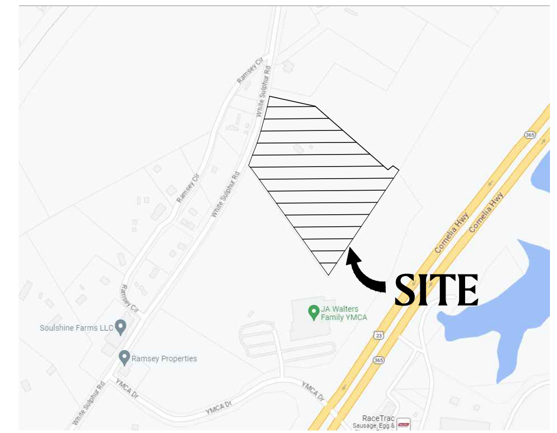
VICINITY MAP SCALE: NTS