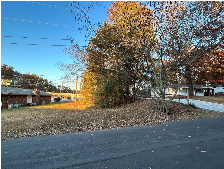
Existing trees on the South Side of the property, creating a buffer between the two properties. – Photo Taken on 11/18/2023