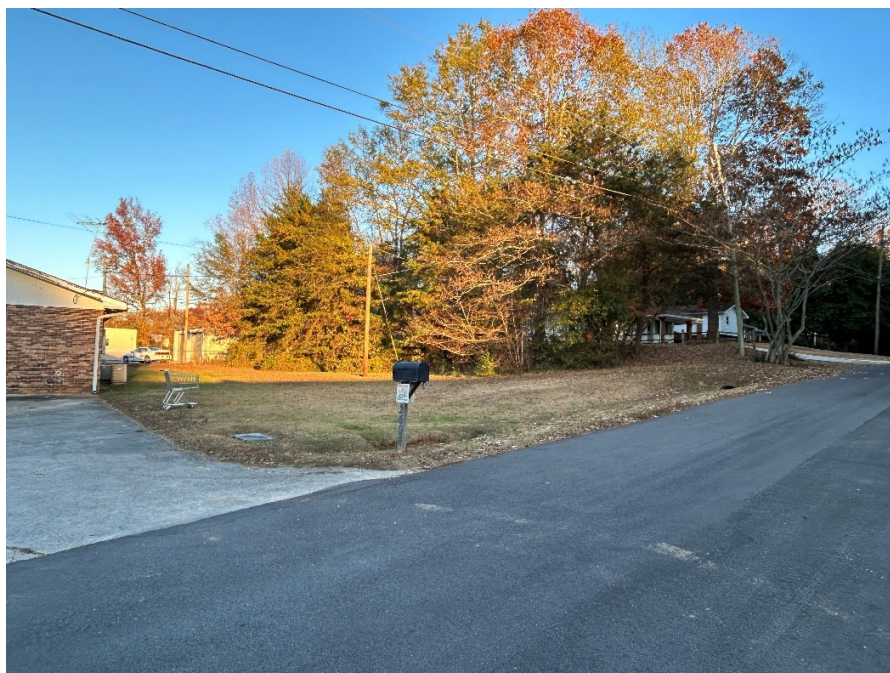
Existing trees on the South Side of the property, creating a buffer between the two properties. – Photo Taken on 11/18/2023