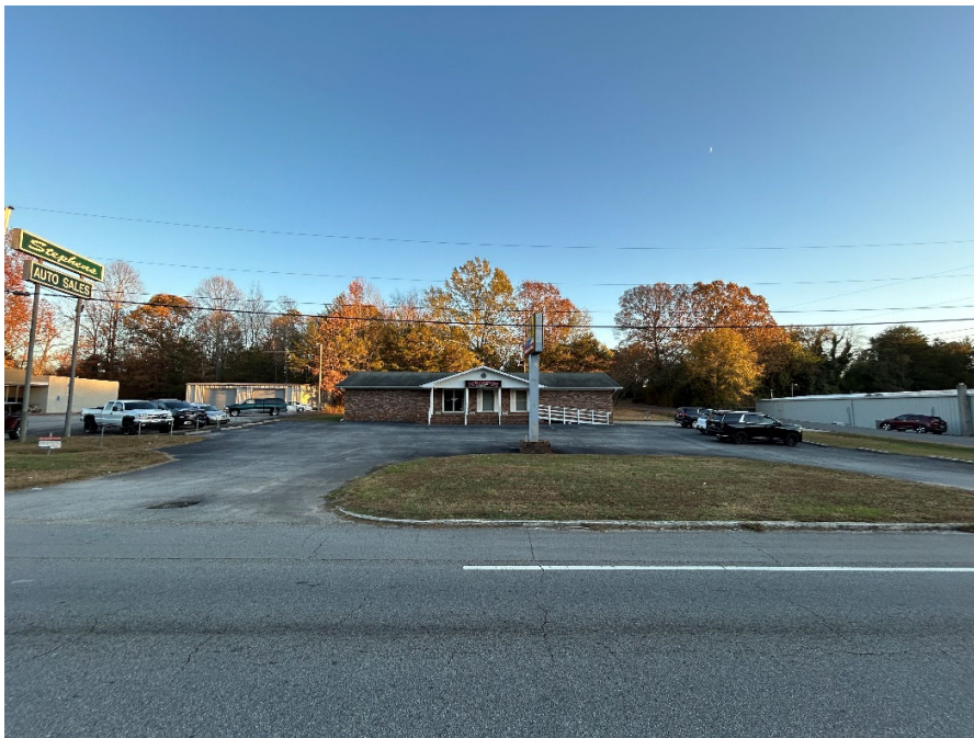
Existing 35' street frontage landscape buffer – Photo Taken on 11/18/2023

The display of cars is essential to the operation of the dealership. The cars that are parked on the side of the road will be in great aesthetic conditions and will only add to the visual quality of the neighborhood.