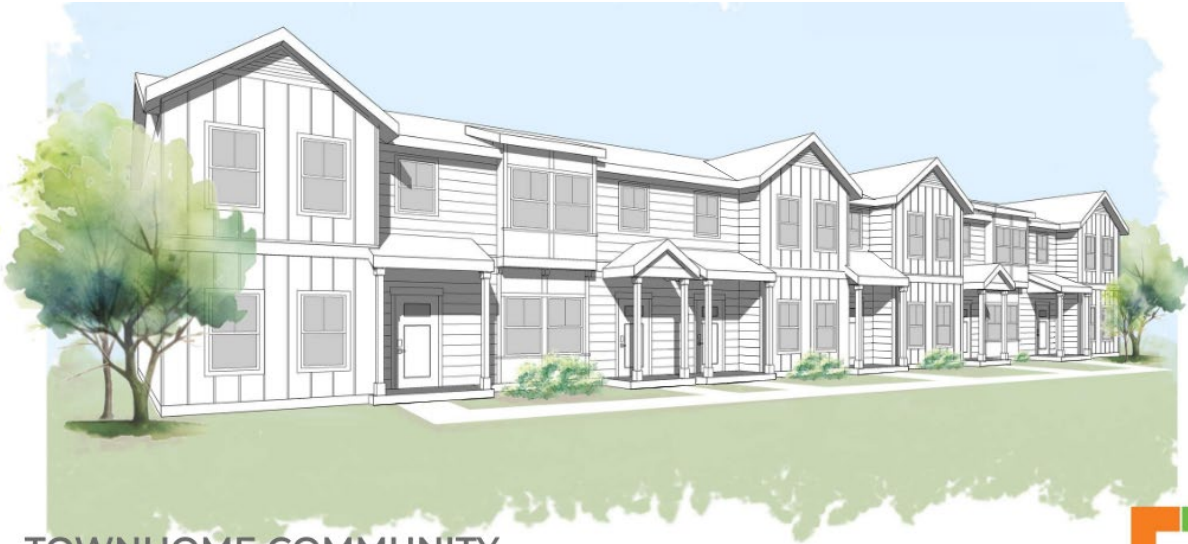
TOWNHOME COMMUNITY REPRESENTATIVE ARCHITECTURE

At a minimum, the Townhome buildings would follow a design theme that would include front facades with a combination of board and batten cementitious panels, cementitious siding, architectural asphalt shingle roofing, with metal accents for select awnings.