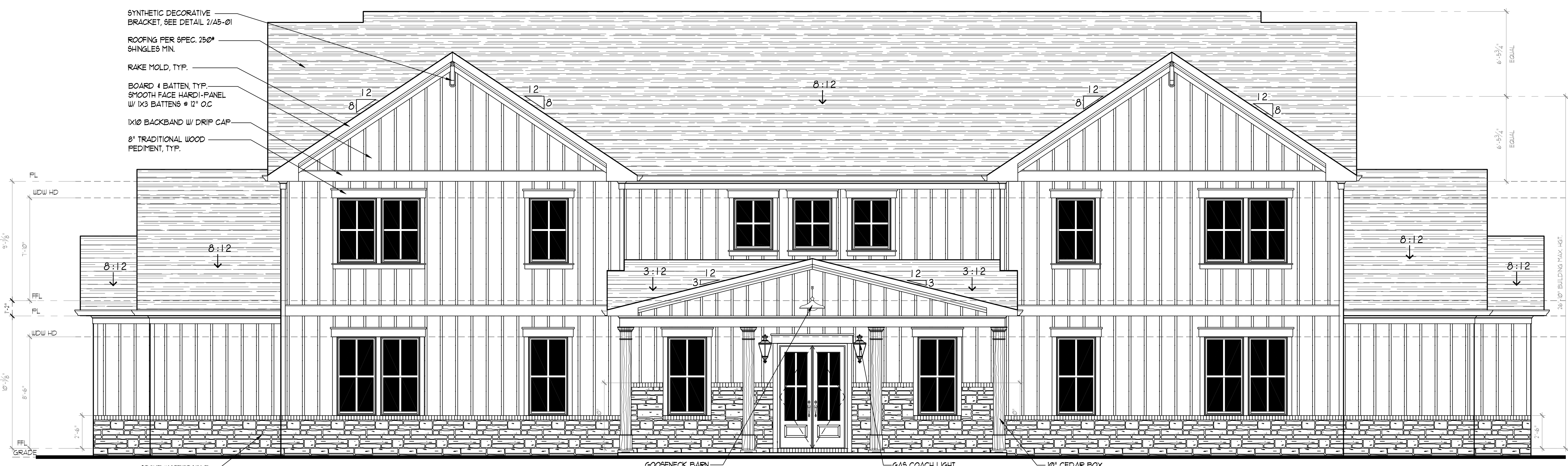
2 Rear Elevation A3-01 SCALE: 1/4" = 1'-0"