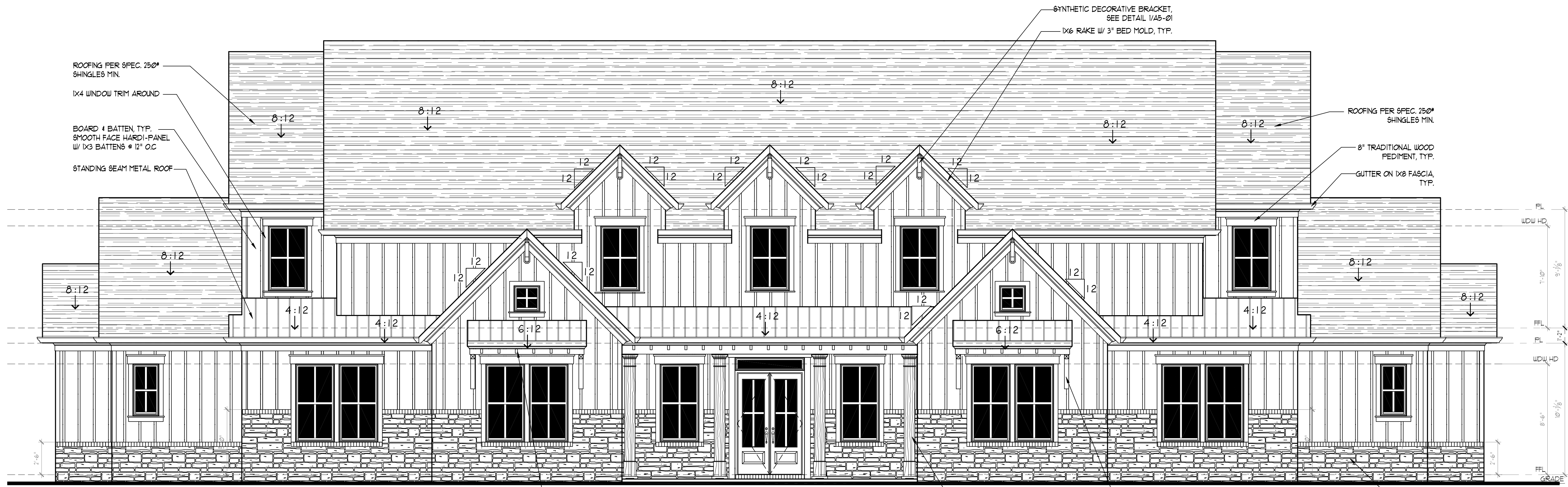
1 Front Elevation A3-01 SCALE: 1/4" = 1'-0"