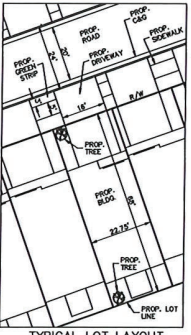
TYPICAL LOT LAYOUT SCALE: 1"=20'

IMPERVIOUS AREA CALCULATIONS: TOTAL LOT AREA = 42.458 ACRES PROPOSED IMPERVIOUS AREA = 8.38 ACRES 8.38 ACRES / 42.458 ACRES = .20 OR 20% IMPERVIOUS