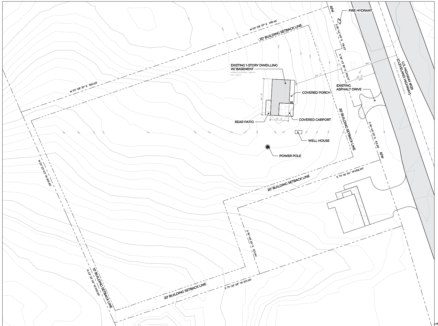
EXISTING - SITE PLAN SCALE: 1" = 30'-0"