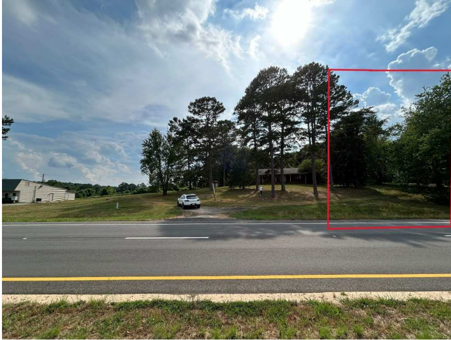
Existing trees on the North Side of the property, creating a buffer between the two properties. – Photo Taken on 07/08/2024