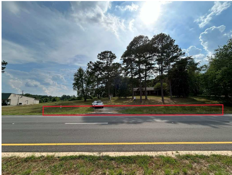
Existing 35' street frontage landscape buffer – Photo Taken on 07/08/2024

The display of cars is essential to the operation of the dealership. The cars that are parked on the side of the road will be in great aesthetic conditions and will only add to the visual quality of the neighborhood.