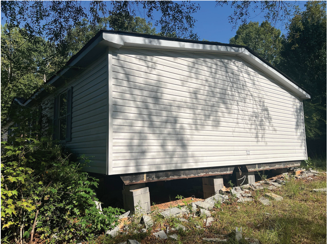
Figure 10: A view of the outer walls