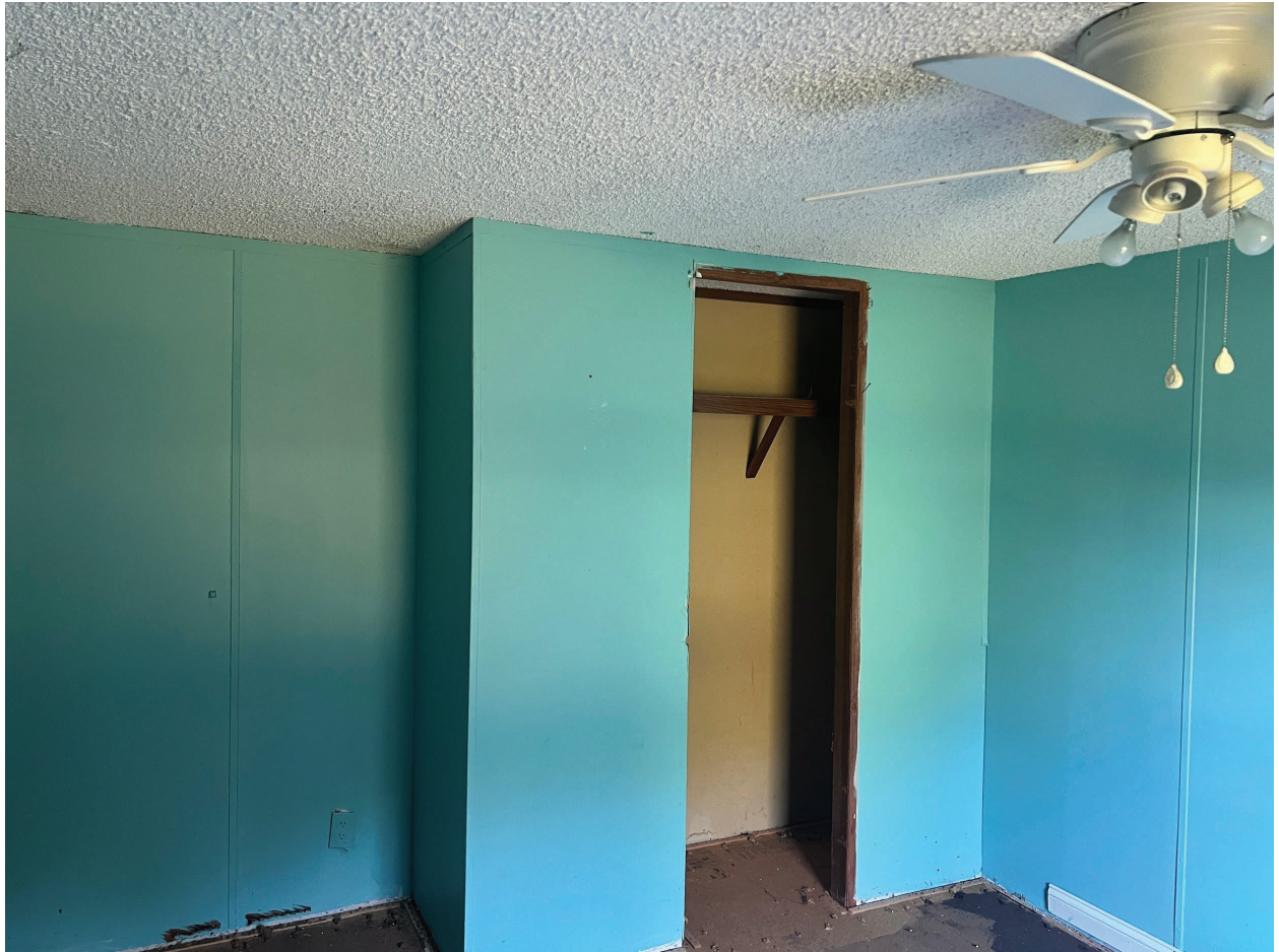
Figure 7: A view of the interior walls and floor