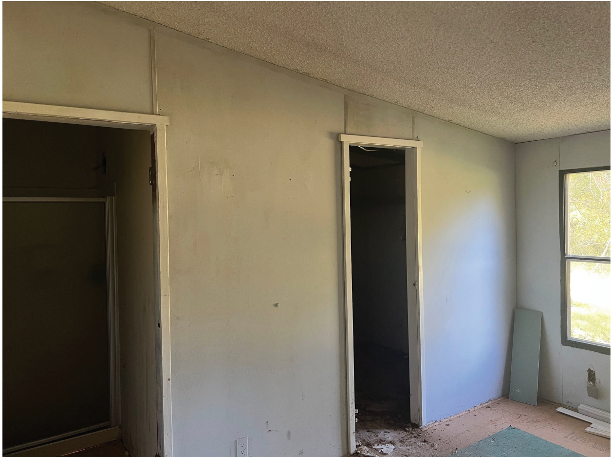
Figure 6: A view of the interior walls and floor