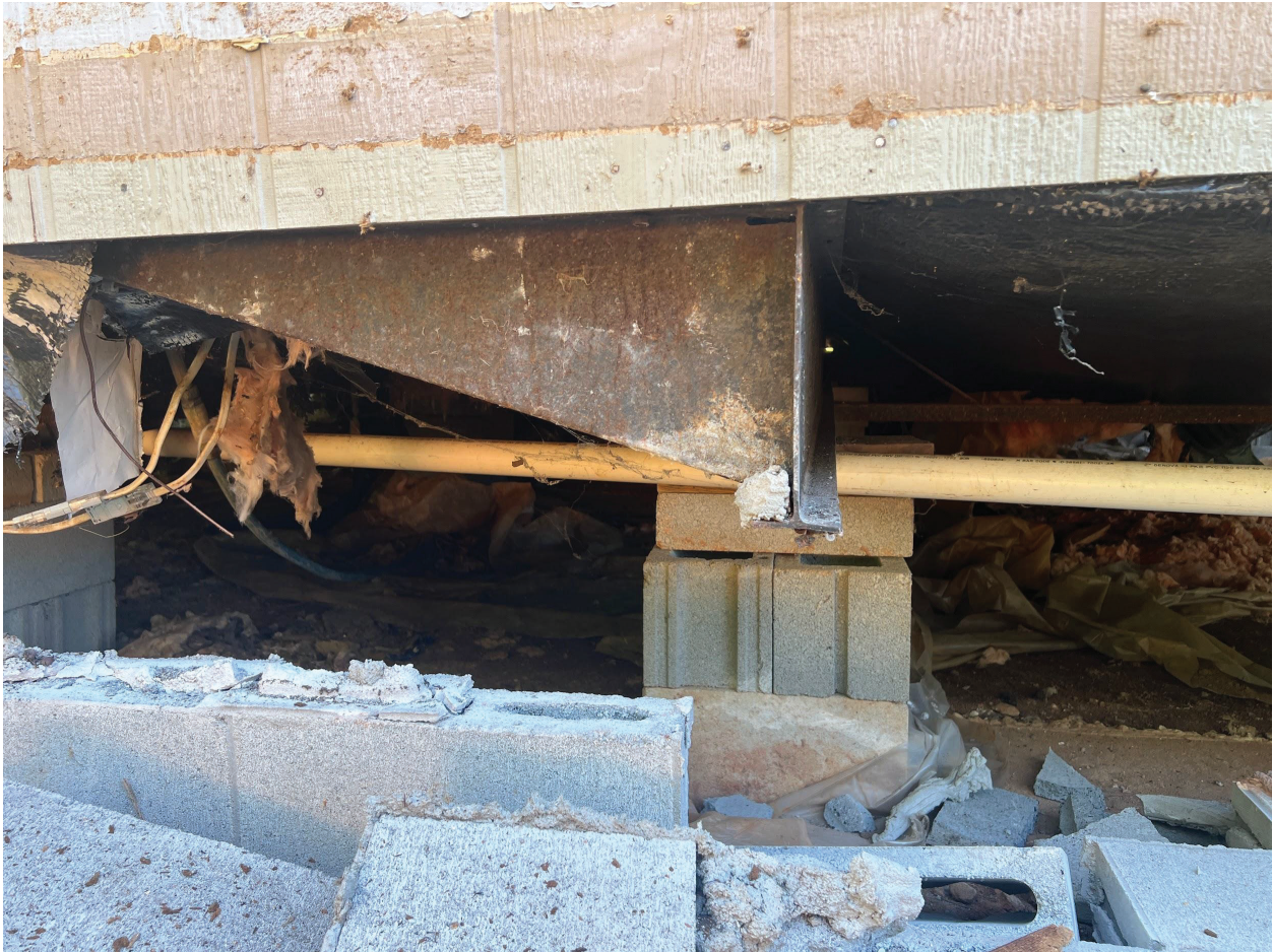
Figure 13: A view from under Mobile Home