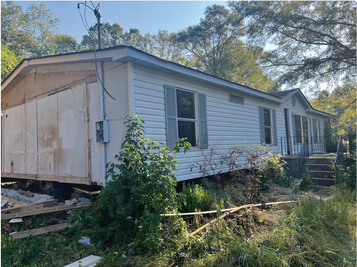
Figure 8: A view of the outer walls