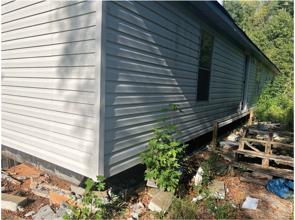
Figure 9: A view of the outer walls