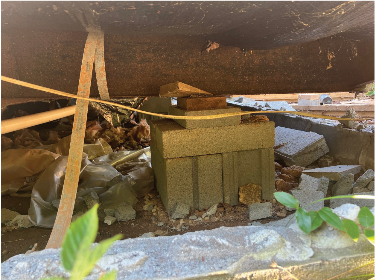
Figure 15: A view from under Mobile Home