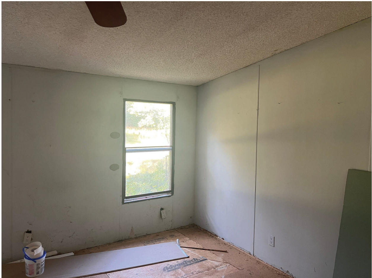
Figure 5: A view of the interior walls and floor