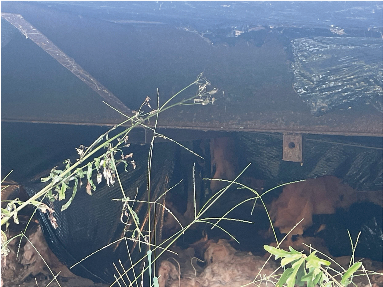
Figure 12: A view from under Mobile Home