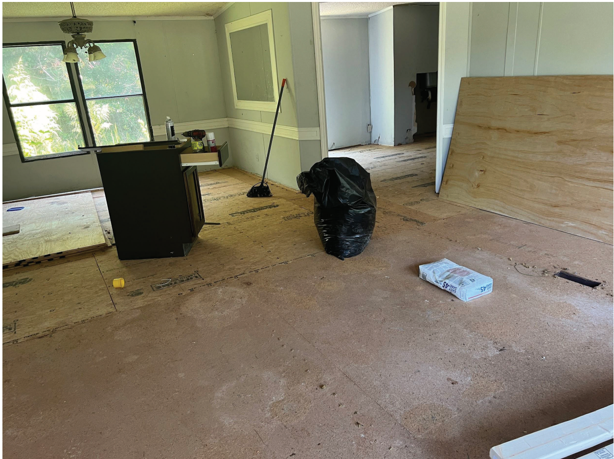
Figure 3: A view of the interior walls and floor