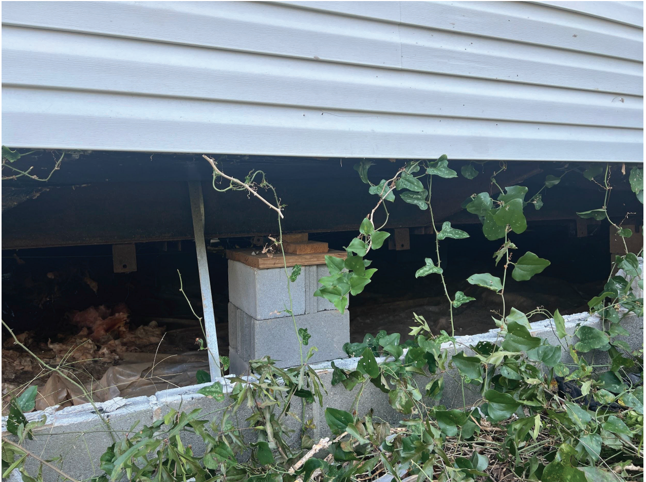
Figure 11: A view from under Mobile Home