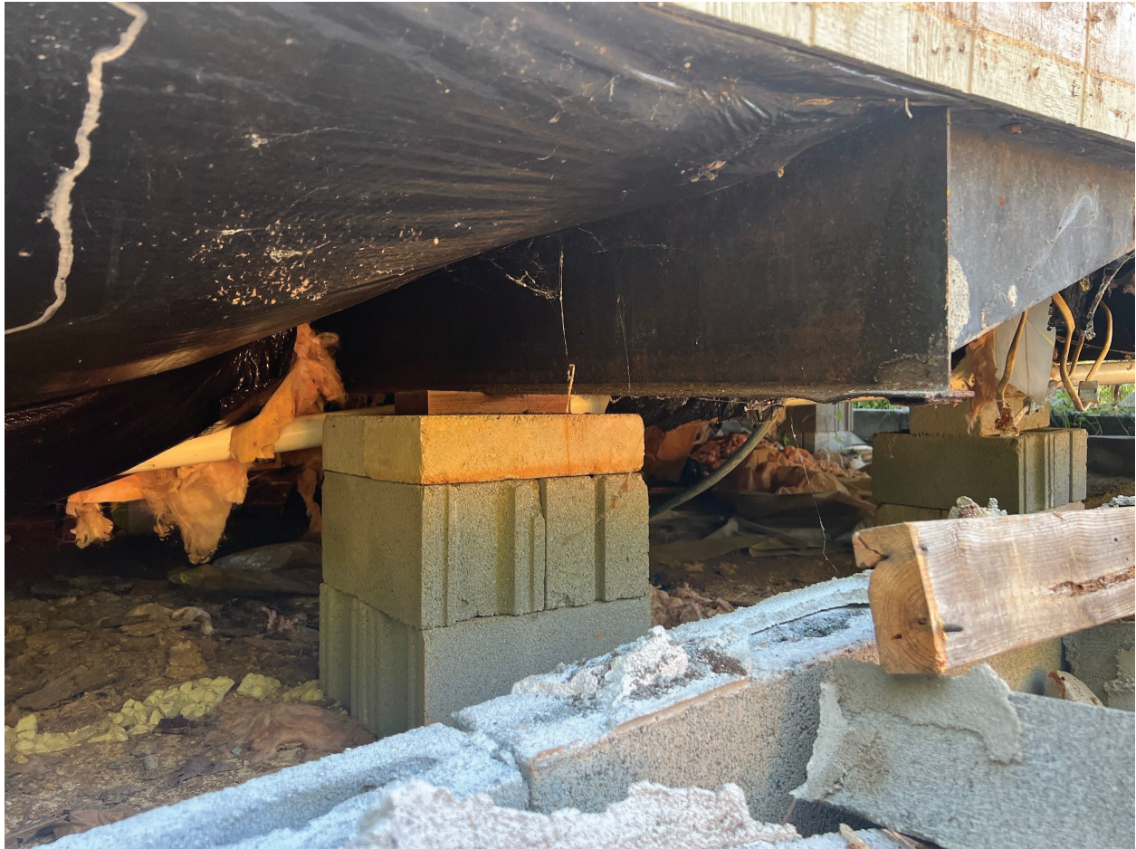
Figure 14: A view from under Mobile Home