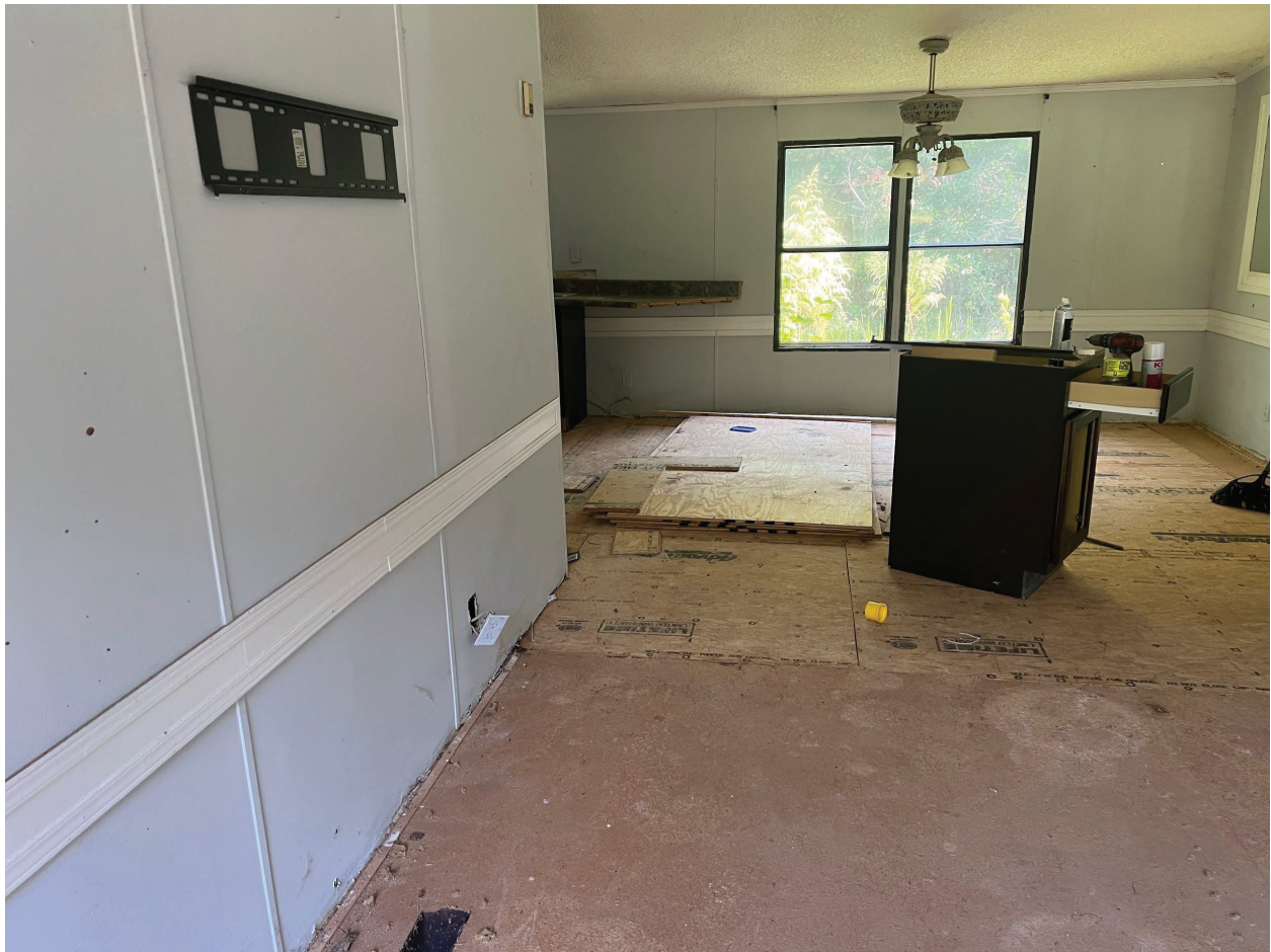
Figure 4: A view of the interior walls and floor