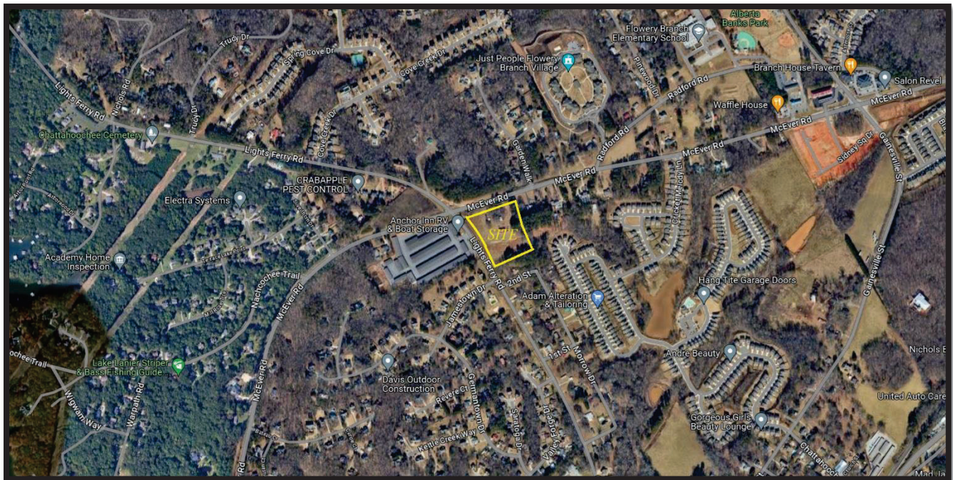
Figure 1 – Site Location Map

The trip generation was calculated for a proposed commercial center in Hall County. The site is located in the northeast corner of McEver Road at Lights Ferry Road, as shown in Figure 1. Vehicular access is proposed at one location on McEver Road and two locations on Lights Ferry Road. A future interparcel connection to adjacent property to the northeast is also proposed.