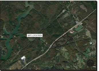
SITE LOCATION MAP NOT TO SCALE

PROPERTY OWNERS: PARCEL ID: 09091 00002 - JOAN W. HICKS (4841 CAGLE ROAD) PARCEL ID: 09091 00003 - BIG HICKORY FARMS, LLC (4865 CAGLE ROAD) PARCEL ID: 09091 00001 - JOAN W. HICKS (ESTATE) (4844 CAGLE ROAD)