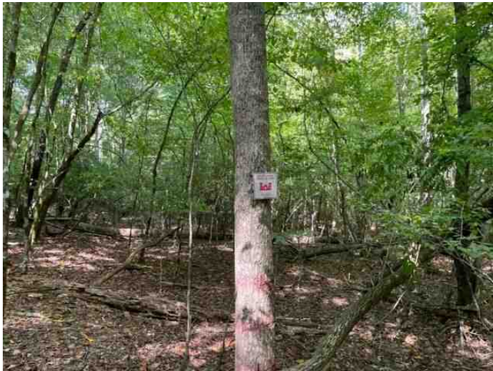
Corp Property Line