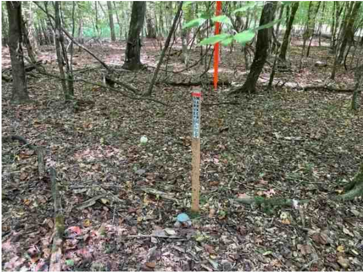
Corp Property Line