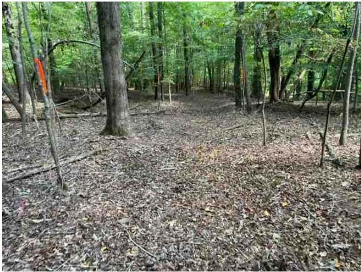
Path to Lake