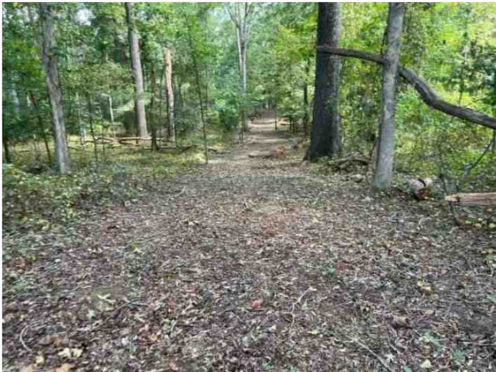
Path to Lake