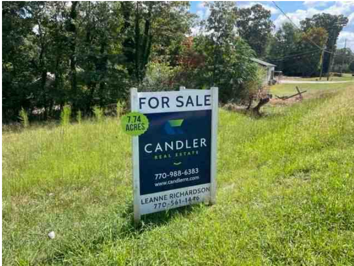
For Sale Sign