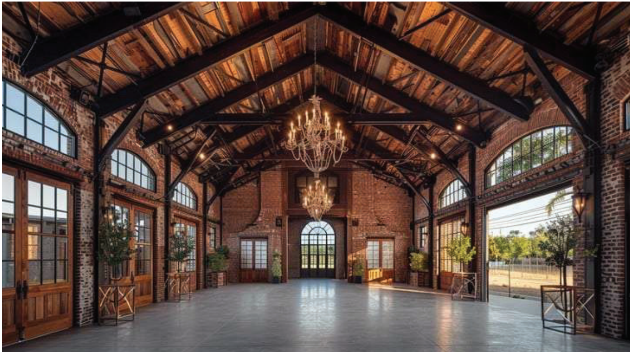
Example architectural style of potential venue space.

The larger event venue is envisioned to host 100 – 200 people. A kitchen will be available to support external catering, or a commercial kitchen will be available for on-site catering. Changing rooms and a dining area are also being considered. The venue would be adjacent to a maintained event lawn. The adjacent performance hall will host indoor seating to accommodate 100-130 people. The accompanying event suites will sleep 2-4 persons each. The event suites are imagined to be between 300sf-500sf.