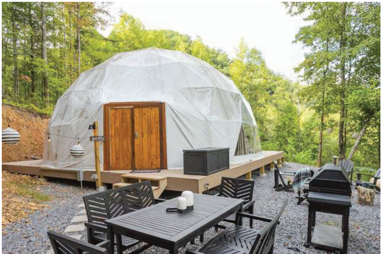
Above is an example of an accommodation provided by Stay Minty's GLAMP site, the 'Moon Dance'.

The campground is situated on 2.01 acres. The property itself is zoned Commercial in Sevier County, TN. The adjacent parcels are zoned Agricultural-1 with residential home uses, providing another precedence for campground and event space uses coinciding with adjacent residential uses.