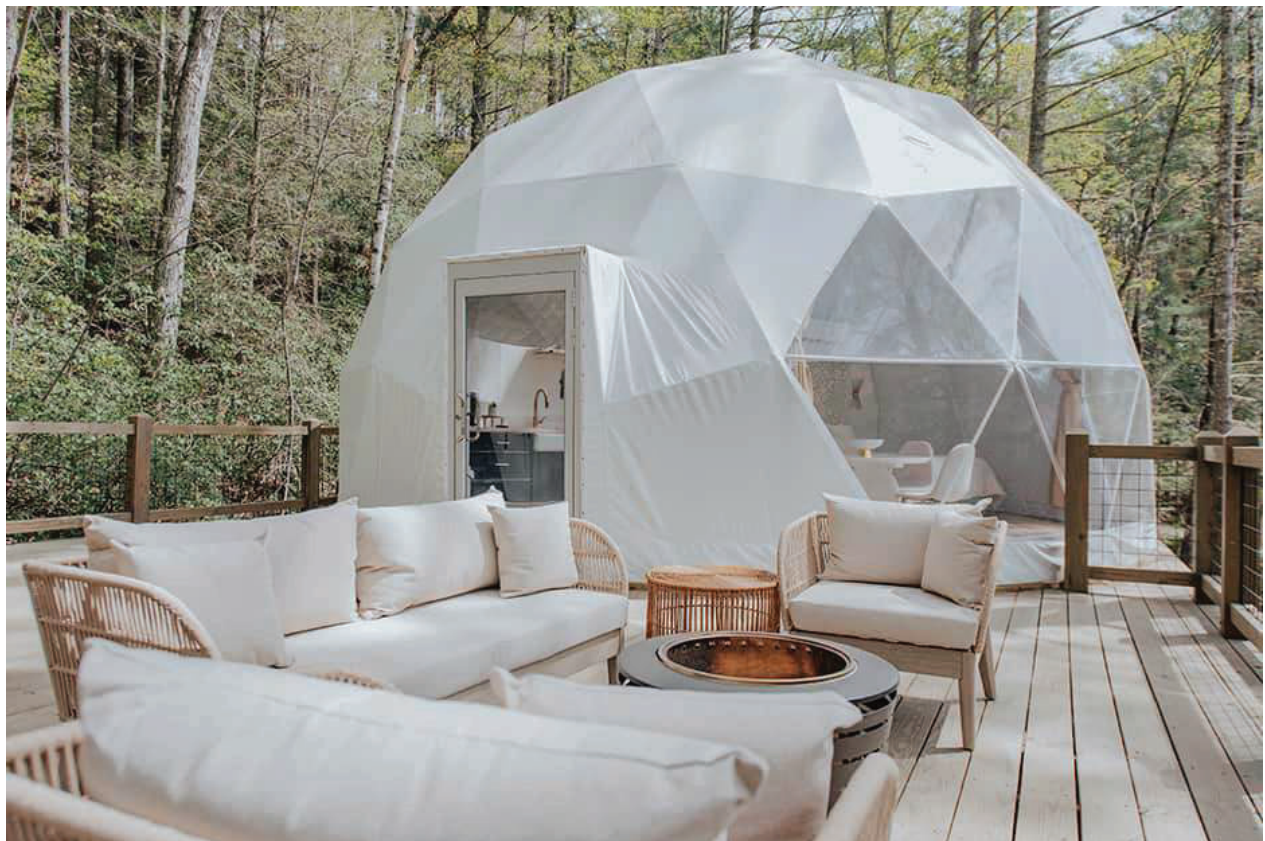
Above is an example of an accommodation provided by Glamp Blue Ridge, the 'Amelia'.

The campground is situated on 25.51 acres. The property itself is zoned Agricultural-1 (A-1) in Gilmer County, GA. The adjacent parcels are zoned Agricultural-1 with residential home uses, providing another precedence for campground and event space uses coinciding with adjacent residential uses.