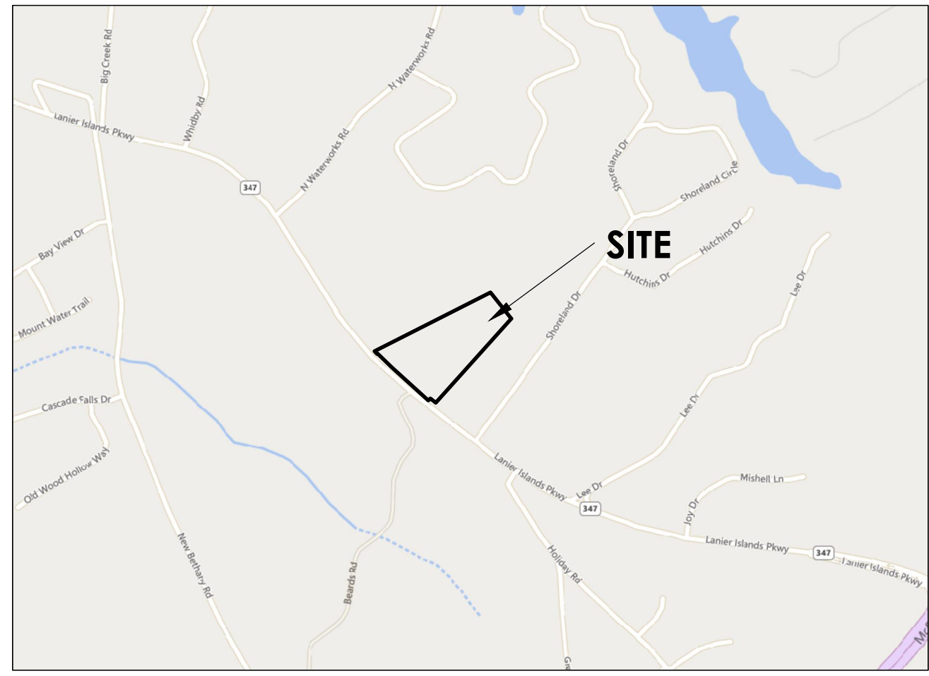
VICINITY MAP 1" = 1000'