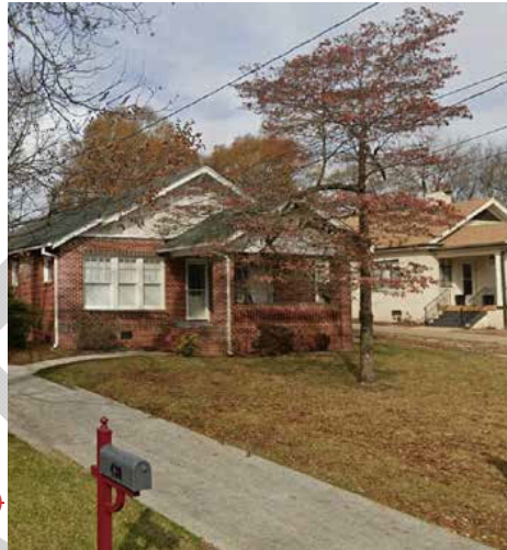
Ridgewood Avenue, Gainesville

*excludes multi-family development in some character areas