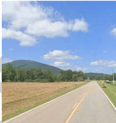
SR 283, Clermont

AG-1, AR-1, O-I, S-S, H-B, PD -PCD (limited)