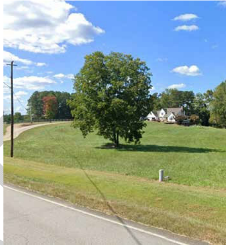
Brookton Lula Road, Lula