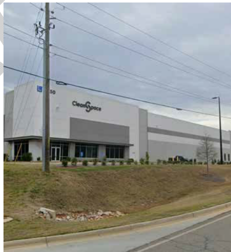
W. White Road