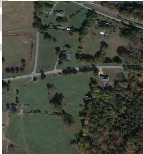
Gillsville Highway, Gillsville