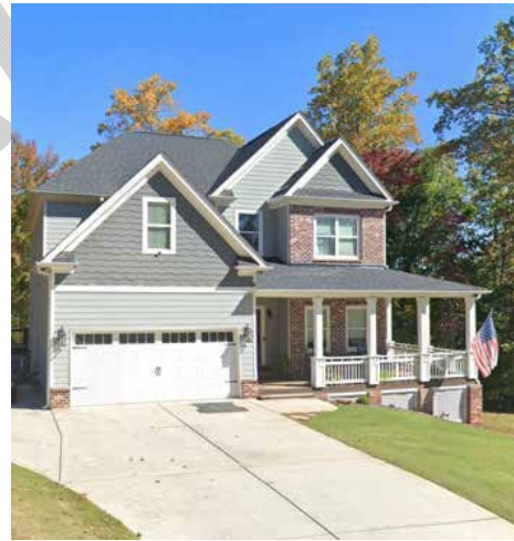
Bush Creek Court, Flowery Branch

Formatted: Indent: Left: 0", Hanging: 0.25"