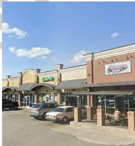
Lake Lanier Islands Parkway

R-X (limited), R-MF (limited), O-I, S-S, H-B, M-U, I-1, PD-PCD, PRD (limited)