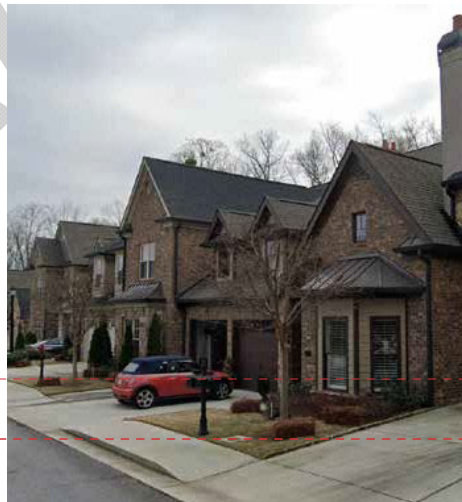
Candler Court, Gainesville

* R-MF is not permitted outside of the urbanized zone.