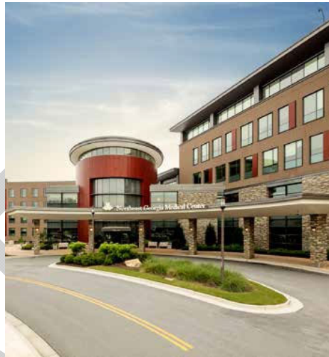
Northeast Georgia Medical Center

R-X (limited), R-MF (limited), O-I, M-U, S-S, H-B , I-1, I-2 (limited), PID, POD, PRD (limited), PD