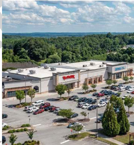
Stonebridge Village, Spout Springs