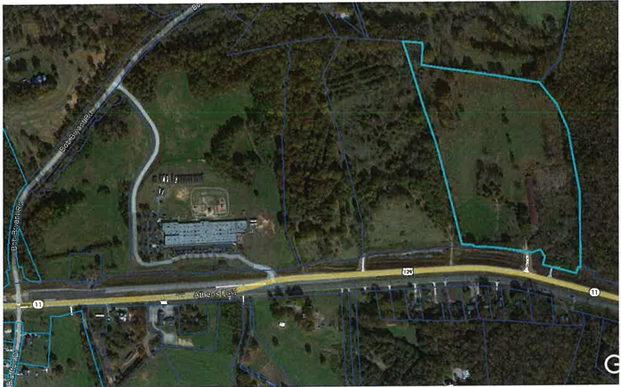
Exhibit A Location Map