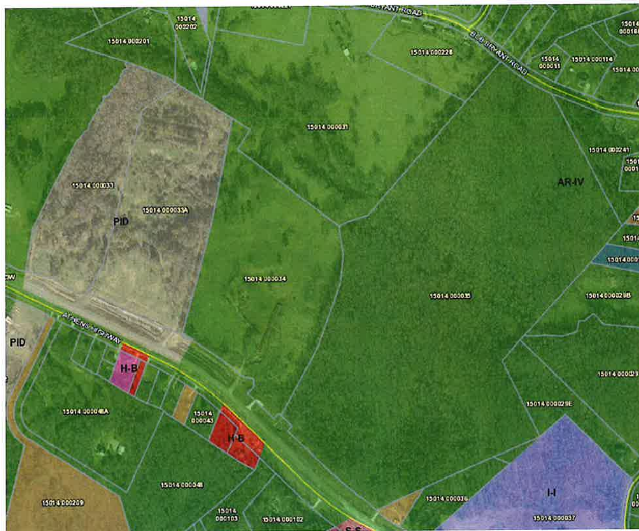
3401 Athens Highway Parcel 15014 00034

R:\Projects\2021\21006266A\Applications-Permits\County\Rezoning\220427_3401 Athens Hwy_NARRATIVE REZONING AMENDMENT.docx