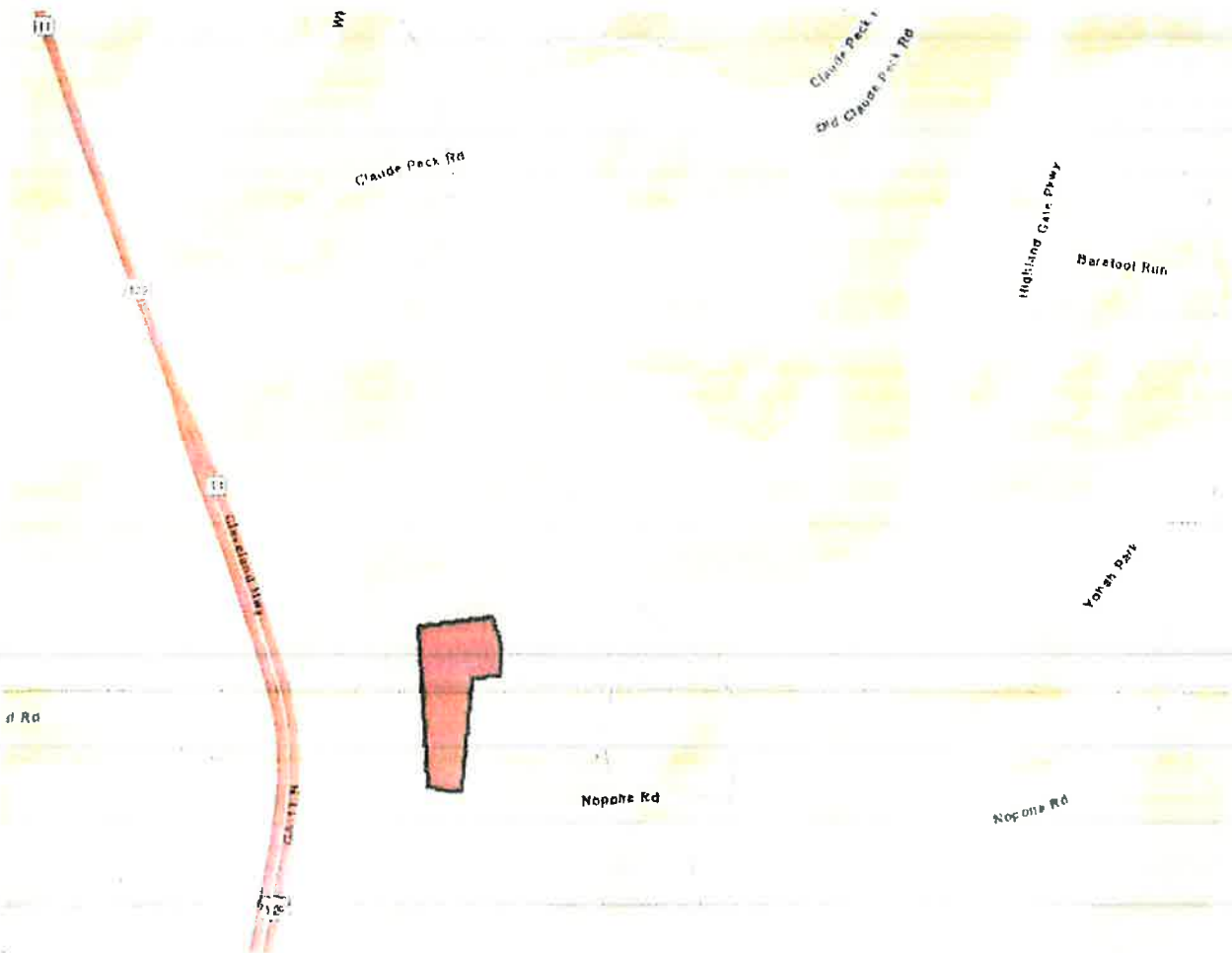
Figure 1 Vicinity Map

The site is located near the northeast corner of the intersection of Nopone Road and Cleveland Highway (Hwy 129 / SR11). The site is bound to the north by the undeveloped portion of PIN 12026 00004 (zoned AR-IV); to the east by the North Hall Community Center and Park (zoned AR-IV); to the south by Nopone Road; and to the west by an existing gas station (zoned S-S).