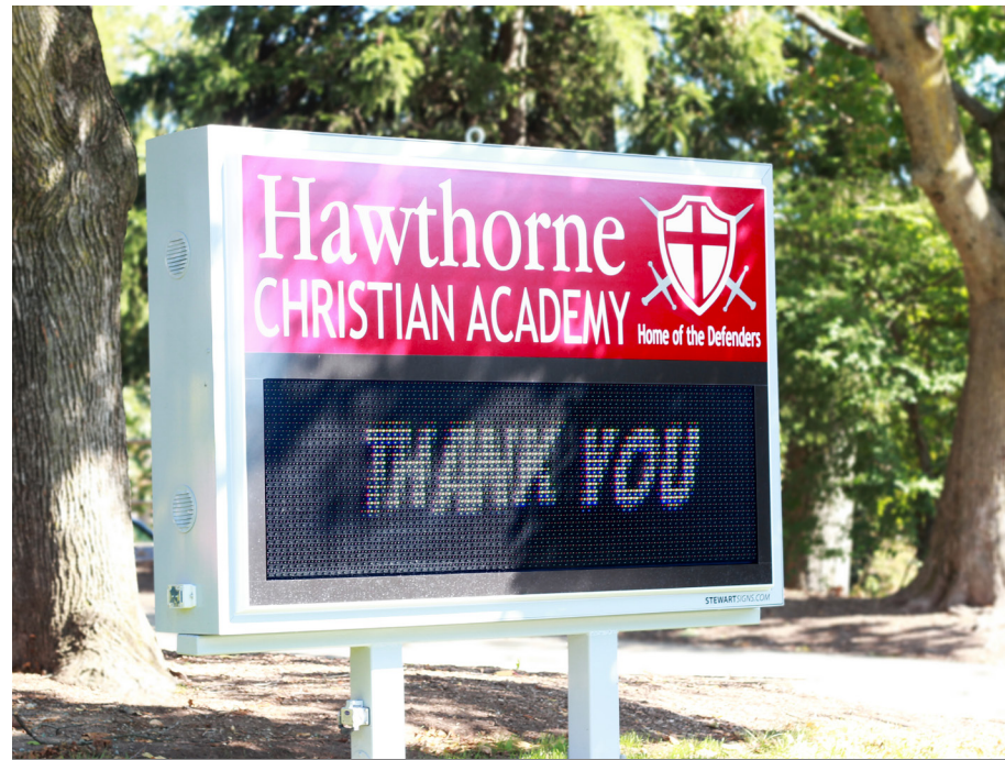
Thank you, PTF, for gifting us with a new digital sign!

VENDOR & CRAFT EXPO Saturday, March 17, 2018