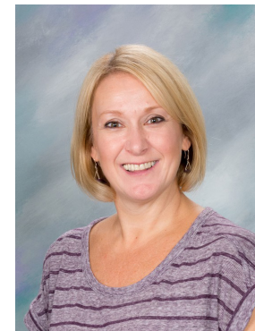
PAM MIRABELLA PRESCHOOL