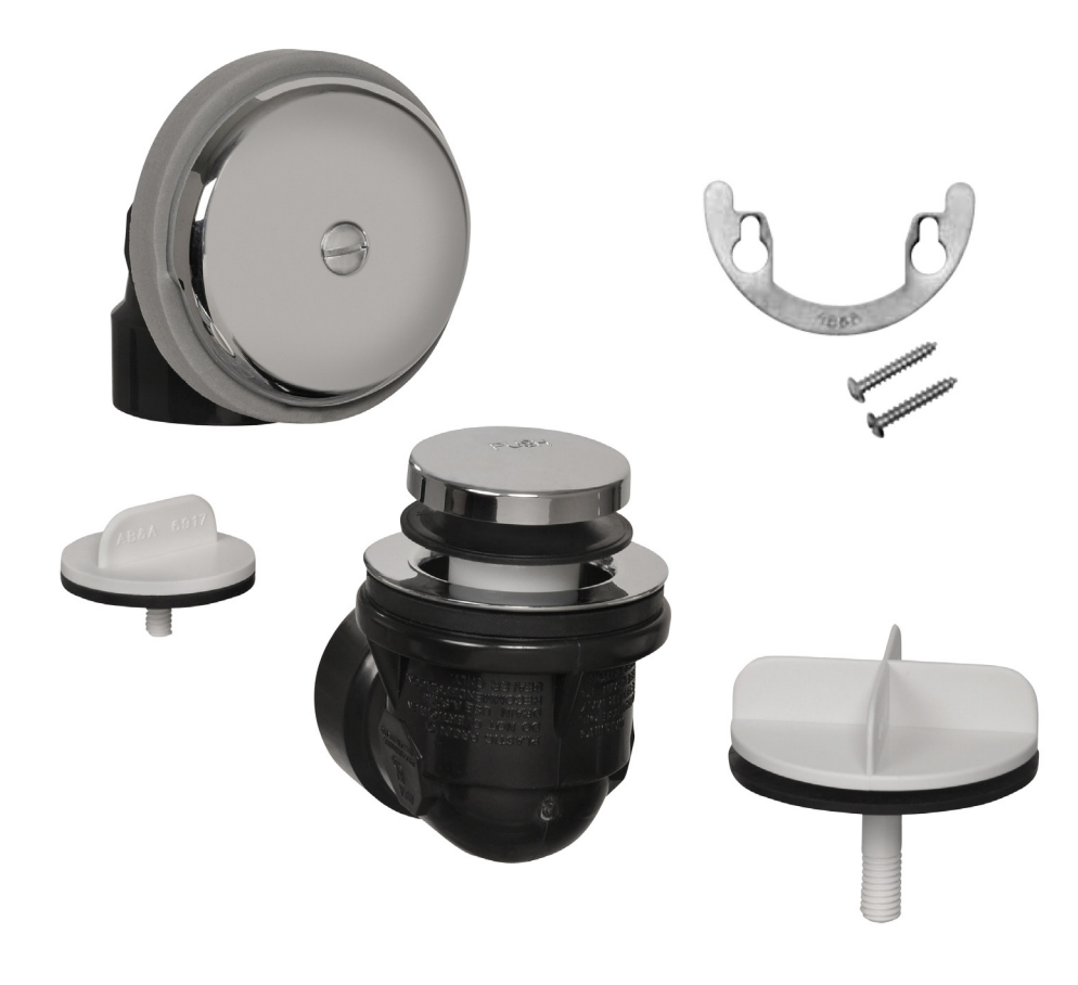
Shown in ABS