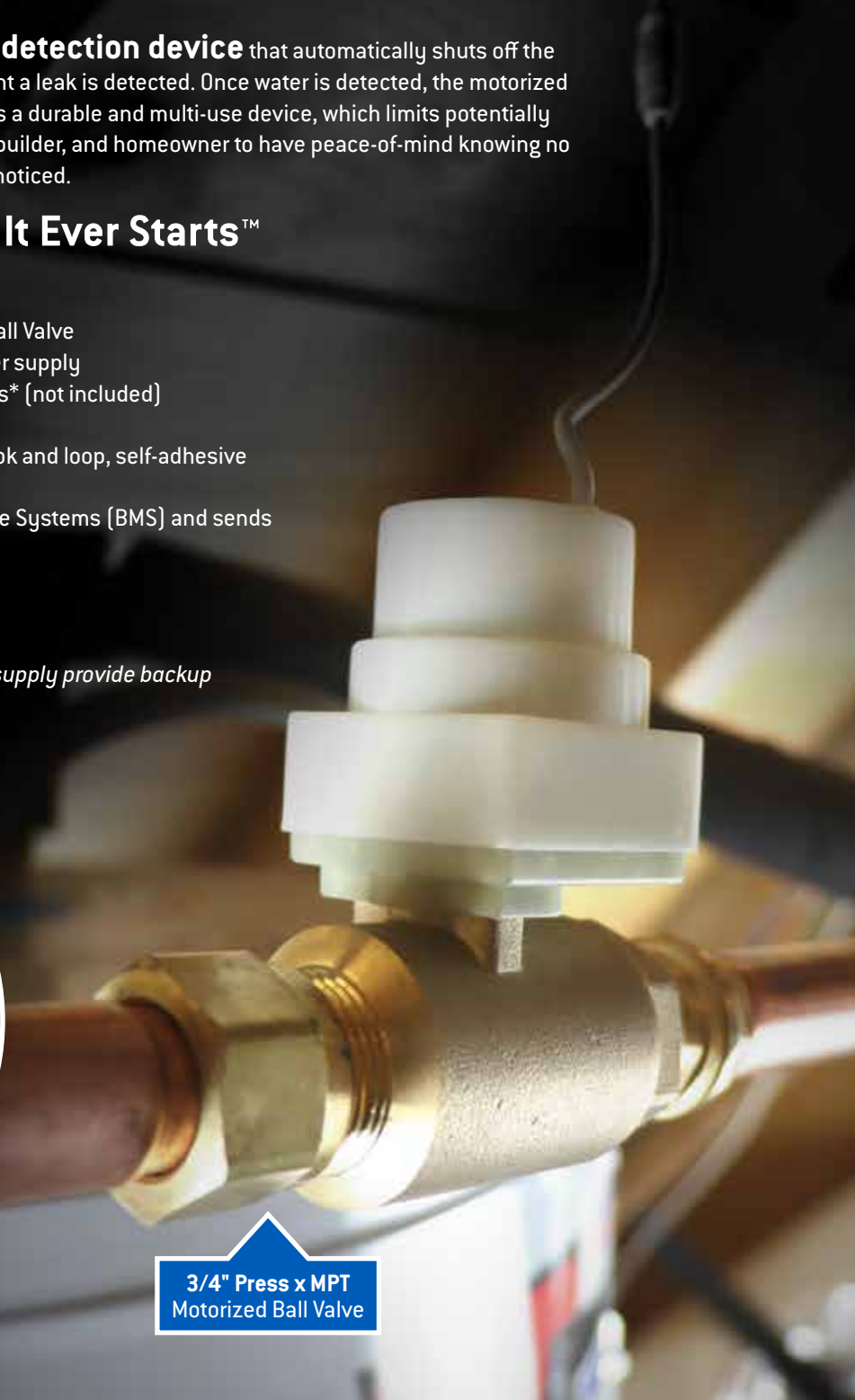
3/4" Press x MPT Motorized Ball Valve