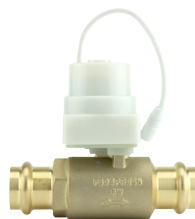
Press x Press Valve KIT

FloodStop offers the most complete line of point-of-use leak detection products and provides the widest selection of valve connection types of all manufacturers.