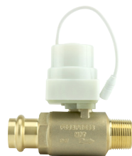
Press x MPT Valve KIT