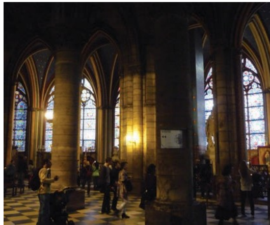
Figure 2.4 | The ambulatory of Notre Dame