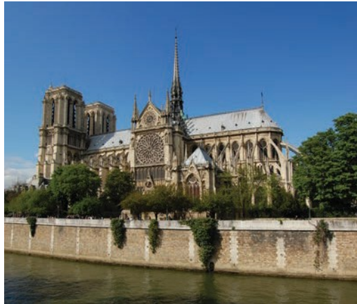
Figure 2.3 | Notre-Dame de Paris

gatherings of fellow nobles, where they forged political alliances, threw lavish parties, and celebrated both love and war in song and dance.