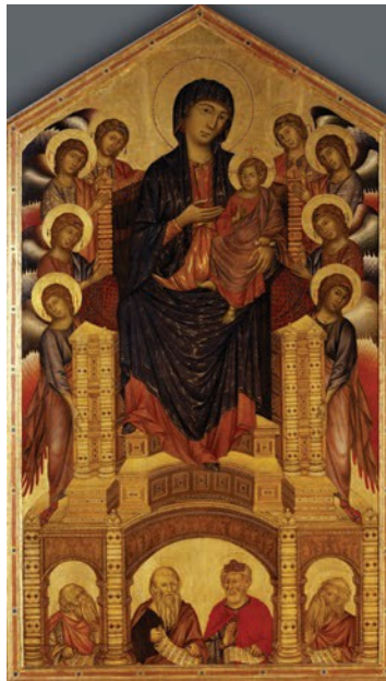
Figure 2.7 | The Virgin Mary featured in a panel from an altarpiece painted by Cimabue around 1280

Medieval Catholic worship included services throughout the day. The most important of these services was the Mass , at which the Eucharist, also known as communion, was celebrated (this celebration includes the consumption of bread and wine representing the flesh and blood of Jesus Christ). Five chants of the mass (the Kyrie, Gloria, Credo, Sanctus, and Agnus Dei) were typically included in every mass, no matter what date in the church calendar. Catholics, as well as some Protestants, still use this Liturgy in worship today.