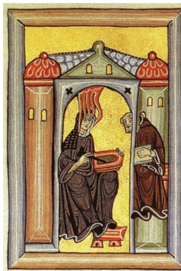
Figure 2.8 | Depiction of Hildegard of Bingen in the Rupertsberger Codex of her Liber Scivias

Many composers of the Middle Ages will forever remain anonymous. Hildegard of Bingen (1098-1179) from the German Rhineland is a notable exception. At the age of fourteen, Hildegard's family gave her to the Catholic Church where she studied Latin and theology at the local monastery. Known for her religious visions, Hildegard eventually became an influential religious leader, artist, poet, scientist, and musician. She would go on to found three convents and become an abbess, the chief administrator of an abbey.