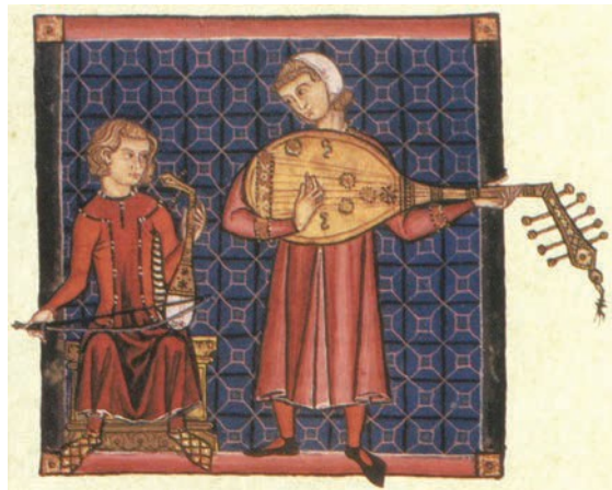
Figure 2.10 | Rebec and Lute Players depicted in Cantigas de Santa Maria

Many songs that merge these two focus points appear in a late thirteenth-century manuscript called the Cantigas de Santa Maria (Songs for the Virgin Mary), a collection sponsored by King Alfonso the Wise who ruled the northwestern corner of the Iberian peninsula. Cantigas de Santa Maria also includes many illustrations of individuals playing instruments. The musician on the left in Figure 2.10 is playing a rebec and the one to the right a lute. Elsewhere in the manuscript these drummers and fifers appear (see Figure 2.11). These depictions suggest to us that, outside of worship services, much vocal music was accompanied by instruments. We believe such songs as these were also sung by groups and used as dance music, especially as early forms of rhythmic notation indicate simple and catchy patterns that were danceable. Other manuscripts also show individuals dancing to the songs of composers such as Machaut.