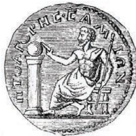
Figure 2.1 | Profile of Pythagoras on ancient coin

We normally start studies of Western music with the Middle Ages, but of course, music existed long before then. In fact, the term Middle Ages or medieval period got its name to describe the time in between (or “in the middle of”) the ancient age of classical Greece and Rome and the Renaissance of Western Europe, which roughly began in the fifteenth century. Knowledge of music before the Middle Ages is limited but what we do know largely revolves around the Greek mathematician Pythagoras, who died around 500 B.C.E. (See his profile on a third century ancient coin: Figure 2.1.)