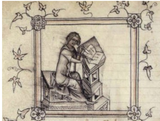
Figure 2.9 | Depiction of Guillaume de Machaut

of fourths, fifths, and octaves. Such intervals are called perfect because they are the first intervals derived from the overtone series (see chapter one). As hollow and even disturbing as perfect intervals can sound to our modern ears, the Middle Ages used them in church partly because they believed that what was perfect was more appropriate for the worship of God than the imperfect.