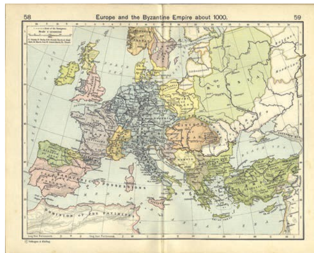
Figure 2.2 | Map of Western Europe

people worshipped together in a similar way, then they might also stick together during political struggles.