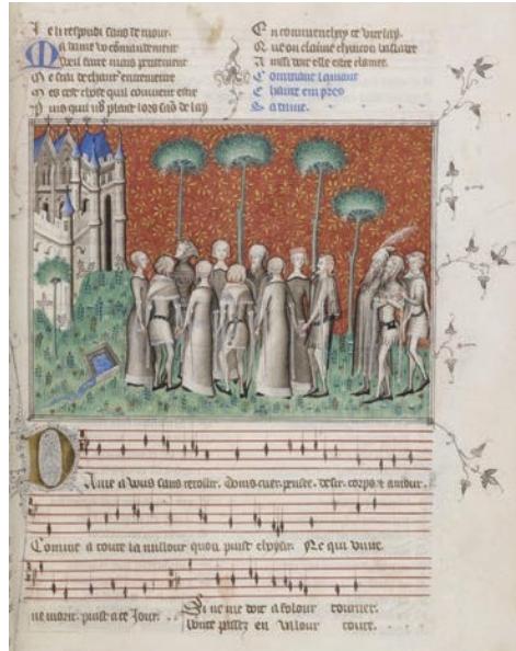
Figure 2.6 | Group of people dancing depicted in Machaut's manuscript

their music in beautifully illuminated manuscripts such as this one that features Guillaume Machaut's "Dame, a vous sans retoller," discussed later. Churchmen such as the monk Guido of Arezzo devised musical systems such as "solfège" still used today.