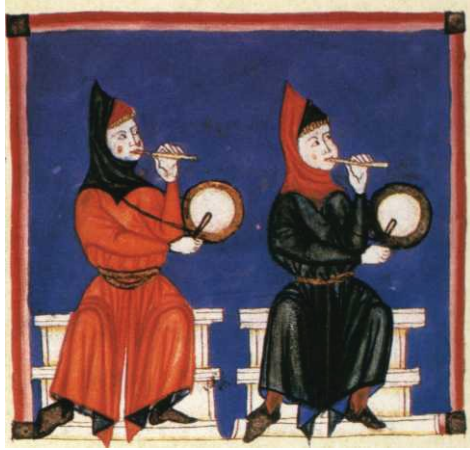
Figure 2.11 | Drummers and Fifers depicted in Cantigas de Santa Maria