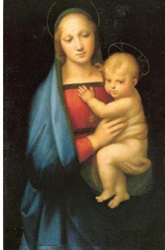
Figure 3.6 | Raphael's Madonna; 1504