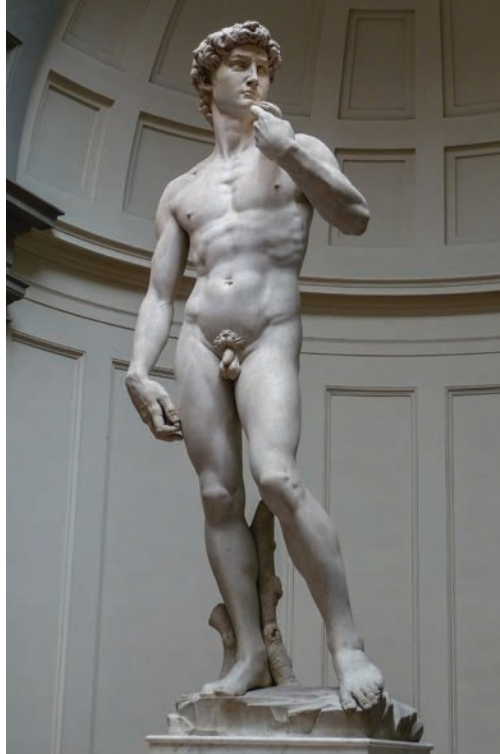
Figure 3.3 | Michelangelo's rendition of David preparing to fight Goliath, stone in hand and sling over his shoulder; 1501-1504