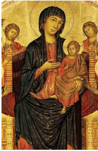
Figure 3.4 | Cimabue's Madonna; 1280