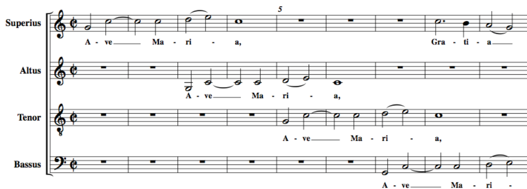
Figure 3.8 | Opening Line of Ave Maria

Josquin's "Ave Maria ...Virgo Serena"("Hail, Mary ... Serene Virgin") ca. 1485 is an outstanding Renaissance choral work. A four part (Soprano, Alto, Tenor, Bass) Latin prayer, the piece weaves one, two, three and four voices at different times in polyphonic texture.