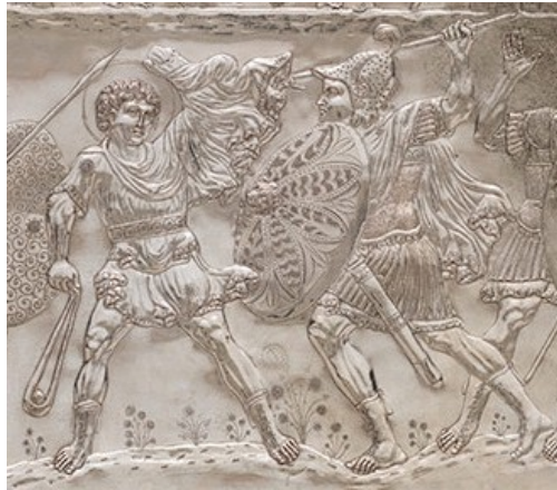
Figure 3.2 | Rendition of David Fighting Goliath found on a Medieval Cast plate; 613-630