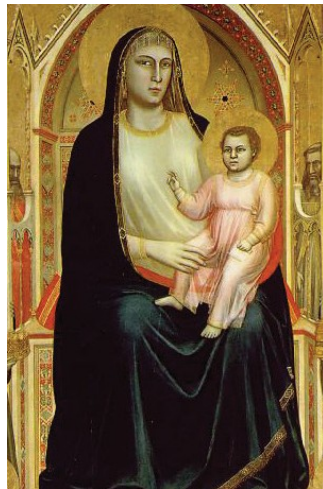
Figure 3.5 | Giotto's Madonna; 1310