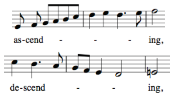
Figure 3.12 | Examples of “word painting” in Weelkes’s “As Vest Was From Latmos Hill Descending”

This composition is a great example of “word painting” where the text and melodic line work together. When the text refers to descending down a hill, the melody descends also.