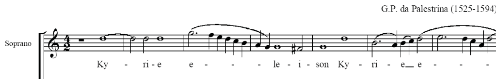
Figure 3.9 | Musical score of “Kyrie” opening