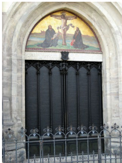
Figure 3.7 | Wittenburg Church

In the Middle Ages, people were thought to be parts of a greater whole: members of a family, trade guild, nation, and church. At the beginning of the Renaissance, a shift in thought led people to think of themselves as individuals, sparked by Martin Luther's dissent against several areas and practices within the Catholic Church. On October 31, 1517, Luther challenged the Catholic Church by posting The Ninety-Five Theses on the doors of the Castle Church in Wittenberg, Germany. The post stated Luther's various beliefs and interpretations of Biblical doctrine which challenged the many practices of the Catholic Church in the early 1500s. Luther felt that educated/literate believers should be able to read the scriptures and become individual church entities themselves. With the invention of the Gutenberg Press, copies of the scriptures and hymns became available to the masses which helped spread the Reformation. The empowerment of the common worshiper or middle class continued to fuel the loss of authority of the church and upper class.