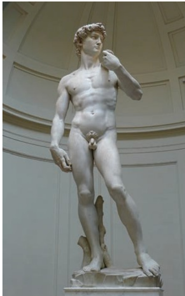
Figure 4.1 | Michelangelo's David