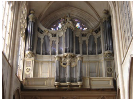
Figure 4.19 | Pipe Organ

pitch through which wind from a wind chest rushes. The length and material of the pipe determines the tones produced. Levers called stops provide further options for different timbres. The Baroque pipe organ operated on relatively low air pressure as compared to today's organs, resulting in a relatively thin transparent tone and volume.