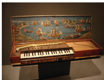
Figure 4.19 | Clavichord

During the early Baroque era, the clavichord remained the instrument of choice for the home; indeed, it is said that Bach preferred it to the harpsichord. It produced its tone by a means of keys attached to metal blades that strike the strings. As we will see in the next chapter, by the end of the 1700s, the piano would replace the harpsichord and clavichord as the instrument of choice for residences.