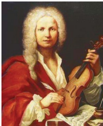
Figure 4.12 | Portrait of Antonio Vivaldi

Each of the concertos in the Four Seasons has three movements, organized in a fast – slow – fast succession. We'll listen to the first fast movement of Spring. Its “Allegro” subtitle is an Italian tempo marking that indicates music that is fast. As a first movement, it is in ritornello form. The movement opens with the ritornello, in which the orchestra presents the opening theme. This theme consists of motives, small groupings of notes and rhythms that are often repeated in sequence. This ritornello might be thought to reflect the opening line from the sonnet. After the ritornello, the soloist plays with the accompaniment of only a few instruments, that is, the basso continuo. The soloist's music uses some of the same motives found in the ritornello but plays them in a more virtuosic way, showing off one might say.