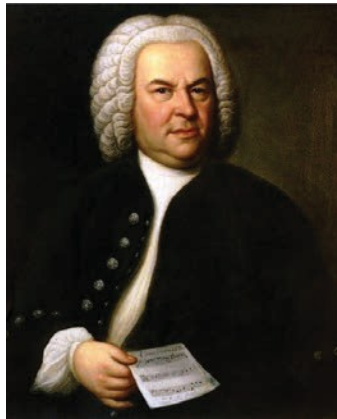
Figure 4.16 | Portrait of Johann Sebastian Bach