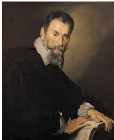
Figure 4.4 | Claudio Monteverdi

One of the very first operas was written by an Italian composer named Claudio Monteverdi (1567-1643). (See Figure 4.4.) For many years, Monteverdi worked for the Duke of Mantua in central Italy. There, he wrote Orfeo (1607), an opera based on the mythological character of Orpheus from Ovid’s Metamorphoses . In many ways, Orpheus was an ideal character for early opera (and indeed many early opera composers set his story): he was a musician who could charm with the playing of his harp not only forest animals but also figures from the underworld, from the river keeper Charon to the god of the underworld Pluto. Orpheus’s story is a tragedy. He and Eurydice have fallen in love and will be married. To celebrate, Eurydice and her female friends head to the countryside where she is bitten by a snake and dies. Grieving but determined, Orpheus travels to the underworld to bring her back to the land of the living. Pluto grants his permission on one condition: Orpheus shall lead Eurydice out of the underworld without looking back. He is not able to do this (different versions give various causes), and the two are separated for all eternity.