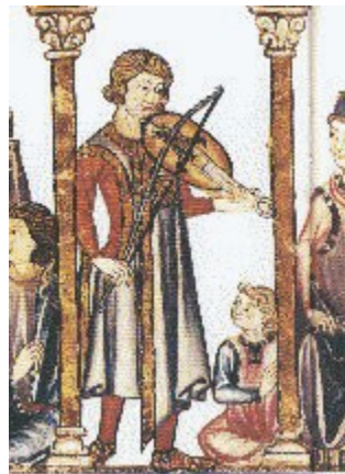
Figure 4.10 | Vielle player