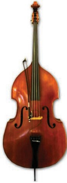
Figure 4.9 | Double Bass