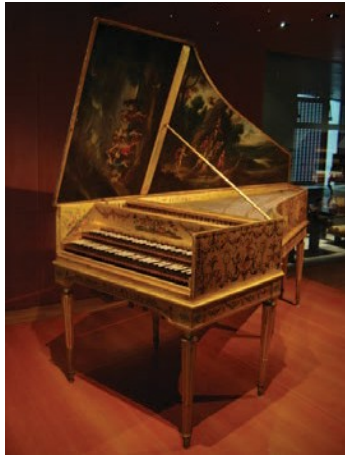
Figure 4.18 | Harpsichord

are broken into arpeggios. Harpsichords are used a great deal for counterpoint in the middle voices.