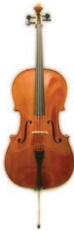
Figure 4.8 | Cello