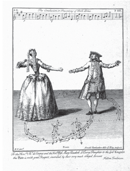
Figure 4.14 | An illustration from Kellom Tomlinson's Art of Dancing, London, 1735