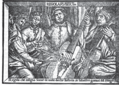
Figure 4.11 | Regola Rubertina Titelbild