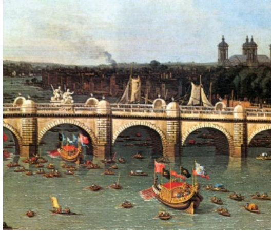
Figure 4.15 | Westminster Bridge from the North on Lord Mayor's Day