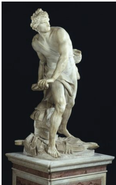
Figure 4.2 | Bernini's David

Author | Galleria Borghese Official Site