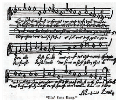
Figure 4.17 | Ein' feste Burg ist unser Gott Sheet Music