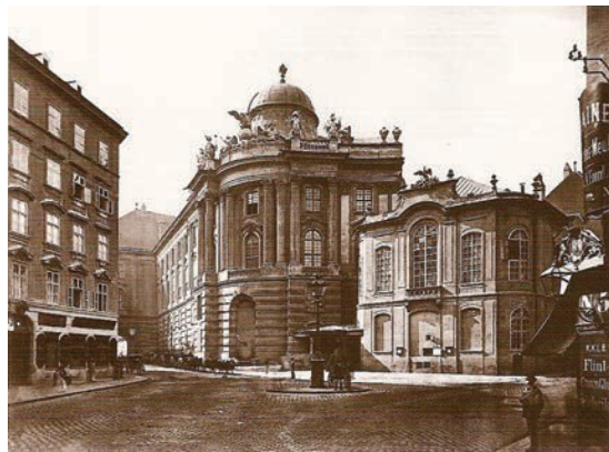
Figure 5.7 | Burgtheater

time include Symphonies No. 3 through No. 8 and famous piano works, such as the sonatas “Waldstein,” “Appassionata,” and “Lebewohl” and Concertos No. 4 and No. 5. He continued to write instrumental chamber music, choral music, and songs into his heroic middle period. In these works of his middle period, Beethoven is often regarded as having come into his own because they display a new and original musical style. In comparison to the works of Haydn and Mozart and Beethoven’s earlier music, these longer compositions feature larger performing forces, thicker polyphonic textures, more complex motivic relationships, more dissonance and delayed resolution of dissonance, more syncopation and hemiola (hemiola is the momentary simultaneous sense of being in two meters at the same time), and more elaborate forms.