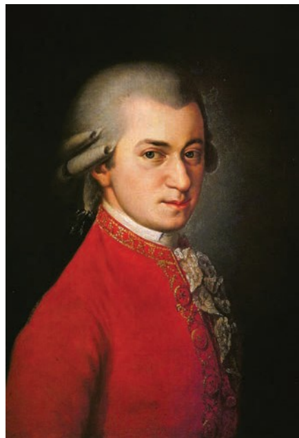
Figure 5.5 | Wolfgang Amadeus Mozart

Mozart's father was quite proud of his children, both being child prodigies. At age seven, Wolfgang, his father, and his sister Maria Anna (nicknamed "Nannerl") embarked on a tour featuring Wolfgang in London, Munich, and Paris. As was customary at the time, Wolfgang, the son, was promoted and pushed ahead with his musical career by his father. While his sister, the female, grew up traditionally, married, and eventually took care of her father Leopold in his later years. However, while the two siblings were still performing, these tours occurred from when Wolfgang was between the ages of six and seventeen. The tours, though, were quite demeaning for the young musical genius in that he was often looked upon as just a superficial genre of entertainment rather than being respected as a musical prodigy. He would often be asked to identify the tonality of a piece while listening to it or asked to sight read and perform with a cloth over his hands while at the piano. Still, the tours allowed young Mozart to accumulate knowledge about musical styles across Europe. As a composer prior to his teens, the young Mozart had already composed religious works, symphonies, solo sonatas, an opera buffa, and Bastien and Bastienne , an operetta; in short, he had quickly mastered all the forms of music.