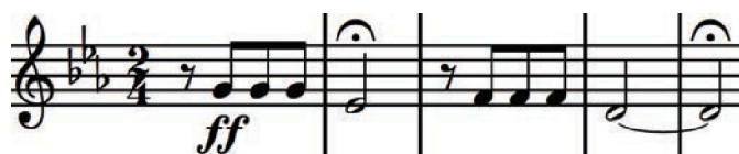
Figure 5.8 | Opening of Symphony No. 5, Op. 67

The most famous part of the Fifth Symphony is its commanding opening. This opening features the entire orchestra playing in unison a musical motive that we will call the short-short-short-long (SSSL) motive, because of the rhythm of its four notes. We will also refer to it as the Fate motive, because at least since the 1830s, music critics have likened it to fate knocking on the door. The short notes repeat the same pitch and then the long, held-out note leaps down a third. After the orchestra releases the held note, it plays the motive again, now sequenced a step lower, then again at the original pitches, then at higher pitches. This sequenced phrase, which has become the first theme of the movement, then repeats, and the fast sonata-form movement starts to pick up steam. This is the exposition of the movement.