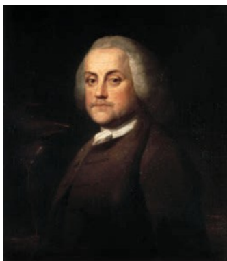
Figure 5.1 | Benjamin Franklin, 1759

Being able to solve and understand many of the mysteries of the universe in a quantifiable manner using math and reason, was empowering. Much of the educated middle class applied these learned principles to improve society. Enlightenment ideals lead to political revolutions throughout the Western world. Governmental changes such as Britain's embrace of constitutional democratic form of government and later the United States of America's establishment of democratic republic completely changed the outlook of the function of a nation/state. The overall well-being and prosperity of all in society became the mission of governance.