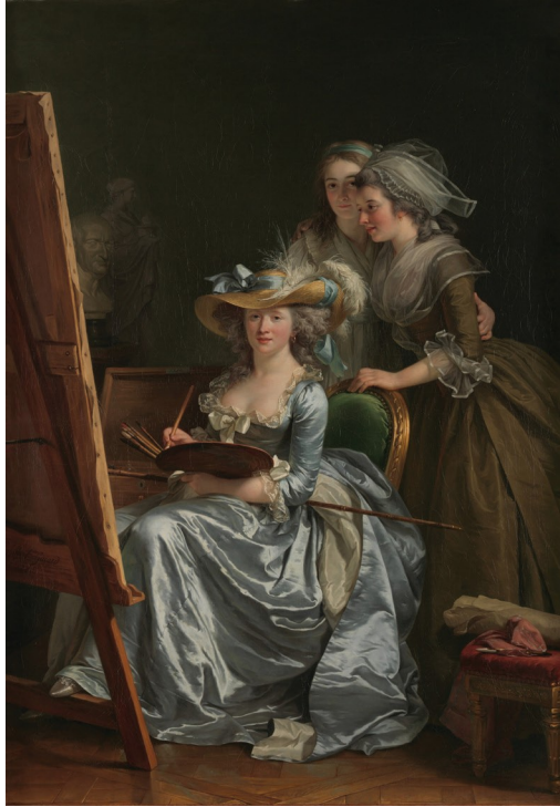
Figure 6.6 | Self-Portrait with Two Pupils