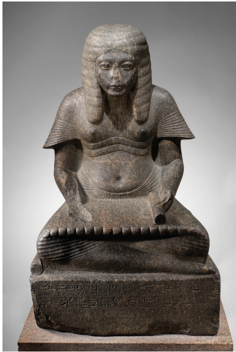
Figure 6.17 | Haremhab as a Scribe of the King

paper and printing methods from as early as the first century, these did not appear in the Western world for centuries afterwards. The invention of the printing press and movable type by Johannes Gutenberg in Germany in 1439 was truly momentous, as both written and pictorial forms could then be replicated and dispersed widely. (Figures 6.18 and 6.19)