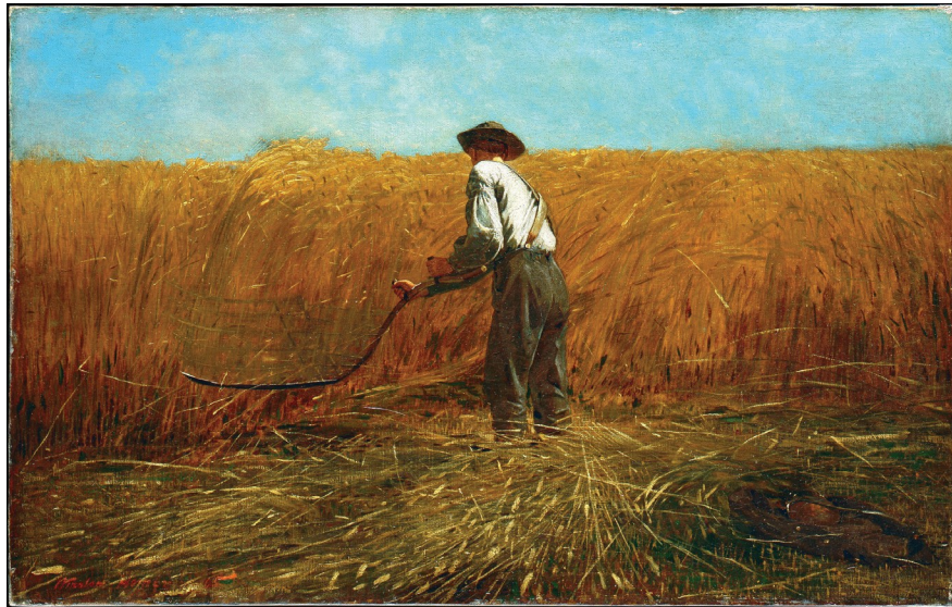
Figure 6.10 | The Veteran in a New Field

war ended and President Abraham Lincoln was assassinated, both events occurring in April 1865. Homer depicts a soldier who has returned to his farm. Having cast aside his Union jacket, the soldier-farmer has taken up his scythe and, with broad horizontal sweeps, harvests a bountiful crop. This quiet scene is a reminder of the never-ending process of life, death, and rebirth. Homer captures the sense of anxious relief, deep sorrow, and tentative hope individuals and nation alike were experiencing at that time of transition.