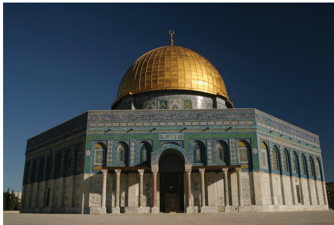
Figure 6.8 | The Dome of the Rock

The events that have been agreed upon as having occurred, and their relative importance, are key to understanding the Dome of the Rock or Qubbat as-Kakhrah in Jerusalem. (Figure 6.8) Its site, origins, and various past and present uses are all factors in the shrine's meaning and significance to the people of different backgrounds and faiths for whom it is a holy place. The Dome of the Rock was completed in 691 CE as a shrine for Muslim pilgrims by the Umayyad caliph, or political and religious leader, Abd al-Malik. The sacred rock upon which the shrine is built marks the site where Muhammad ascended to heaven on a winged horse. Part of the Temple Mount or Mount Zion, the rock is said to have great importance before Muhammad, as well, by those of the Jewish, Roman, and Christian faiths. It is the site where Abraham prepared to sacrifice his son, Isaac; according to the Hebrew Bible, Solomon's Temple, also known as the First Temple, was later erected there; Herod's Temple, completed during the reign of the Persian King Darius I around 516 BCE was next built; and it was destroyed in 70 CE under Roman Emperor Titus, who had a temple to the god Jupiter built on the site.