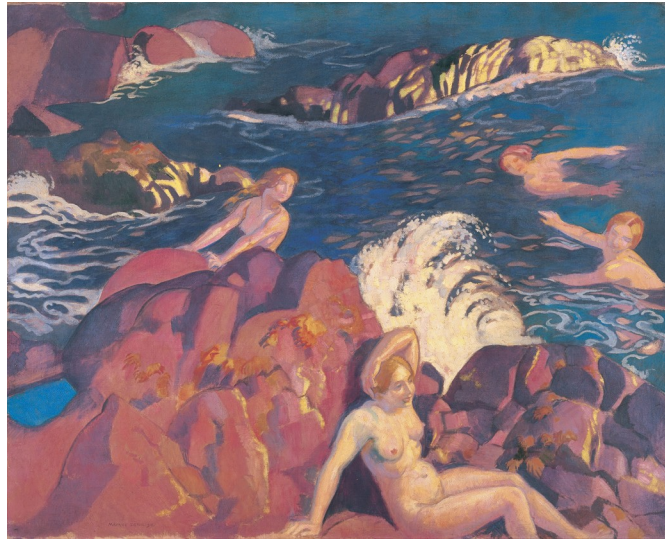
Figure 6.3 | Wave

lyrically flattened in space, he asserted the two-dimensionality of the picture plane, seeking to avoid the delusions of depth and emphasizing the surface of the work and the beauty of color.