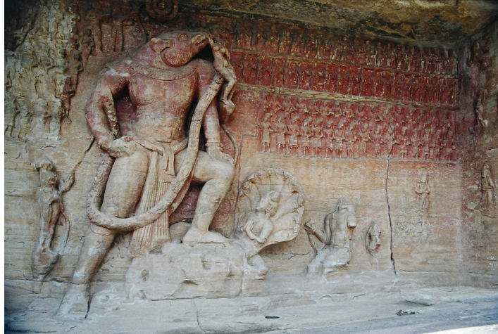
Figure 6.15 | Rock Carving Depicting Vishnu