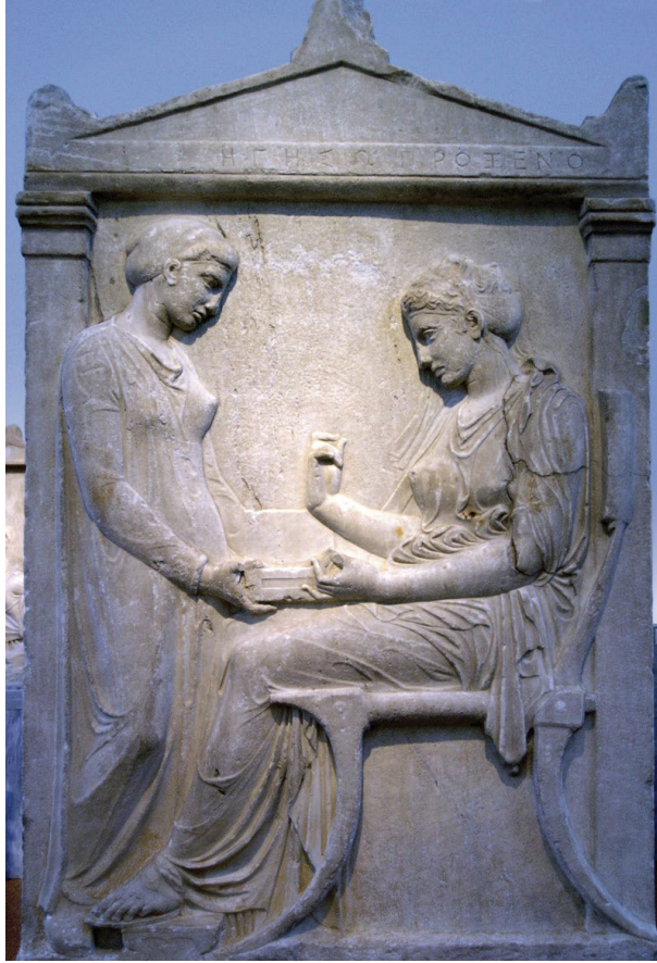
Figure 6.14 | Funerary Stele of Hegeso