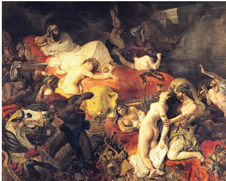
Figure 6.1 | Death of Sardanapalus

Romantic painter Eugène Delacroix (1798-1863, France) spent his lifetime seeking to express the extremes of human emotion and experience in his work based on history, literature, current events, and his own travels. With passages of brilliant color applied in thick, vigorous brush strokes, Delacroix depicted beauty, violence, tragedy, and ecstasy with equal passion, in waves of movement swiftly passing across his canvas. This quality can be seen in The Death of Sardanapalus where the shadowed figure of the Assyrian king surveys the scene of carnage taking place before him with dispassion. (Figure 6.1) Although historical accounts indicate that Sardanapalus did have all of his possessions destroyed, including his concubines and horses, rather than surrender them to his enemies, Delacroix largely relied on his own imagination for his frenzied interpretation and embellishment of the scene.