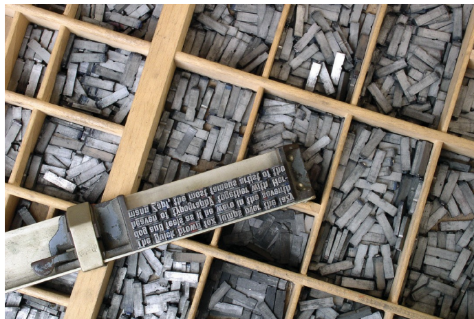
Figure 6.18 | Metal Movable Type