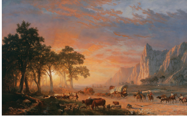
Figure 6.4 | Emigrants Crossing the Plains or The Oregon Trail