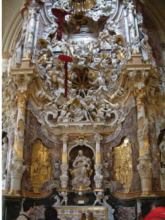
Figure 6.16 | El Transparente Altarpiece at Cathedral of Toledo, Spain