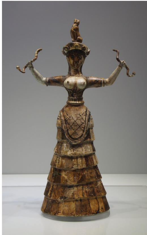
Figure 6.11 | Snake Goddess

associated with fertility and symbolizes the renewal of life due to the fact that it periodically sheds its skin. The object tells us about the type of culture from which it is derived, articulating their beliefs, traditions, and customs. For the Minoans, there was no need to explain or interpret this image because it was easily understood by their community.