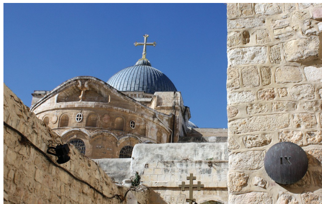
Figure 6.9 | Exterior view of the Church of the Holy Sepulchre

One of the inspirations for the Dome of the Rock is the dome of the Church of the Holy Sepulcher, also in Jerusalem, that was built in 325/326 CE on what is believed to be Calvary, where Jesus was crucified, as well as the sepulcher, or tomb, where he was buried and resurrected. (Figure 6.9) While the overall plans of the two buildings are markedly different, the domes are nearly the same shape and size: the dome of the Church of the Holy Sepulcher is approximately sixty-nine feet in height and diameter, while that of the Dome of the Rock is sixty-seven feet. Each of the eight outer walls of the Dome of the Rock is sixty-seven feet, as well, giving the octagonal structure the balance of relative proportions, and rhythmic repetition of forms found in many Christian central-plan churches, that is, with the primary space located in the center. ( Interior Diagram of the Church )