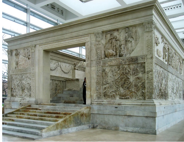
Figure 6.5 | Ara Pacis in Rome, Italy