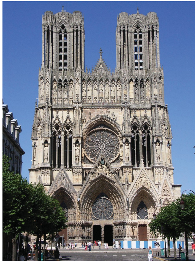
Figure 6.2 | Cathedral of Reims

John Dewey, an American philosopher, psychologist, and educational reformer, in 1934 wrote Art and Experience . He described the aesthetic experience in ways that somewhat reflect the process Delacroix brought to his painting. Dewey stated, however, that although it begins with the art object, the experience of art extends far beyond that one element to produce an ongoing exchange between artist, viewer, and culture at large that culminates in an experience that is a “manifestation, a record and celebration of the life of a civilization.” 1 The “sudden” pleasure one feels when engaging with a work of art or architecture is, in fact, the product of a long process of growth and engagement. For example, walking around and through a grand structure such as Reims Cathedral (1211-1275) in France, with its High Gothic façade, lavish sculptural decoration, extreme verticality, and expansive windows, is breathtakingly impressive because object (building) and experience have coalesced. (Figure 6.2) Further, we continue learning from the experience of observing art or beauty—what, why, and when depends on how much we receive from the experience and from successive encounters.