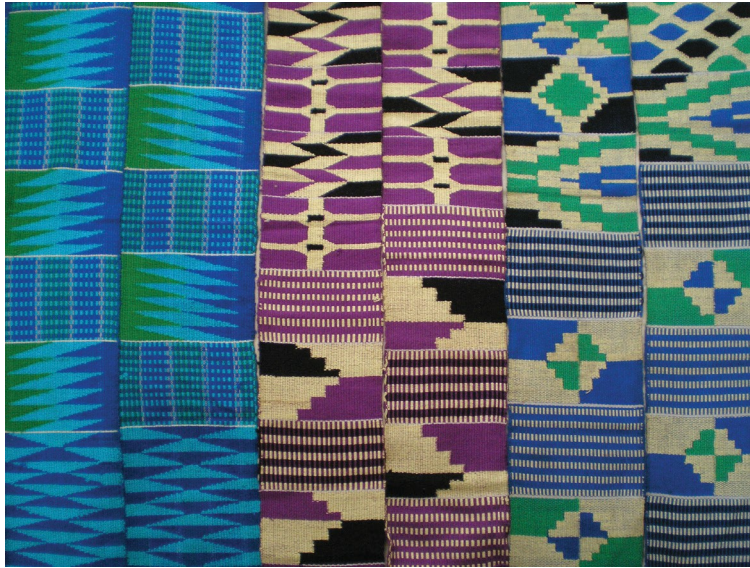
Figure 6.12 | Kente Weaving