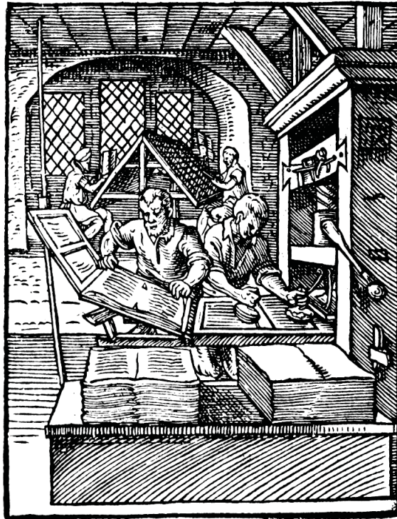
Figure 6.19 | Etching of 16th Century Printer