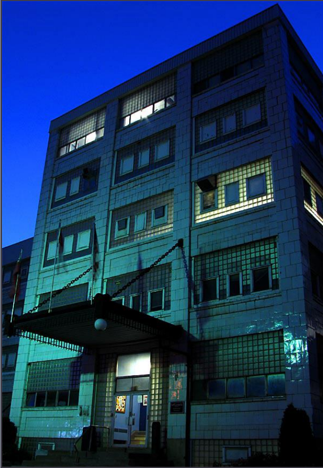
"Cookie Factory"