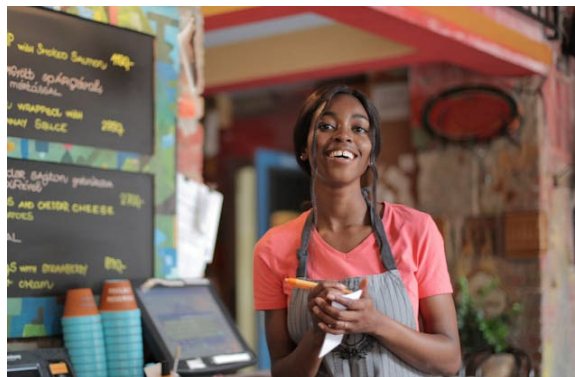
Student expectations for behavior should align to goals that promote employability.

Now that student expectations have been identified, the best way to work on the next step is to create a matrix that includes the student expectations in the row at the top and the various settings in the school in the first column down the side. If the PBS plan is linked to the Iowa 21st Century Employability Skills , it makes sense to include the relevant skill categories in the corresponding row across the top as well. Then, for each of the cells of the matrix, identify examples of appropriate, positively stated, observable behaviors in those settings in relation to the student expectations.