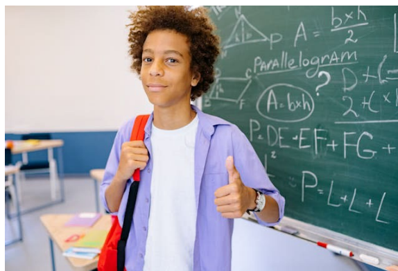
With positive behavior supports, students can adopt new actions that help them learn and grow.

Module 5 emphasizes that meaningful change begins with New Actions by both students and educators. Building skills that lead to New Actions requires intentional teaching, modeling, and consistent feedback. Declarative language, genuine choices, and calm communication can help create safe environments where students can practice self-regulation and decision-making. In addition, Tier 2 supports such as token economies, visual schedules, breaks, timers, check-in/check-out systems, and self-monitoring tools provide scaffolds that help students learn and sustain positive behaviors. These strategies are not just interventions, they are New Actions teaching tools that nurture independence, self-awareness, and hope.