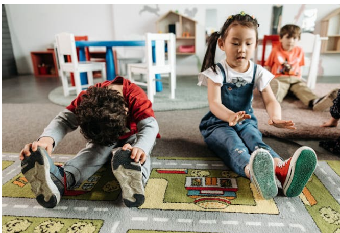
Brief periods of stretching are one type of break for self-regulation.

Breaks are not time out from learning; they’re time in for self-regulation. Strategic, structured breaks help students reset before frustration escalates. By teaching students when and how to take a break, teachers give them tools for self-regulation that prevent meltdowns and preserve dignity.