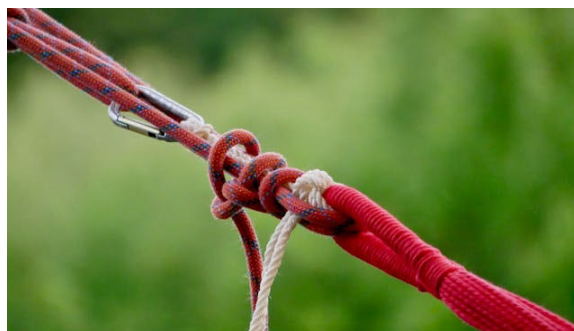
New habits are like a strong cable.

In the spirit of the JONAH strategy, New Actions are more than behavior management, they are opportunities for productive change. Each new response, whether from a teacher or a student, moves the classroom closer to becoming a community shaped by respect, compassion, and hope.