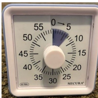
Students learn to manage time by seeing how much time remains for a task.

Timers give students a clear sense of how long an activity will last and when to shift attention. For many students, especially those with ADHD, anxiety, or executive functioning challenges, time can feel abstract or unpredictable. A timer that provides a visible countdown can help them understand the expectation and stay engaged.