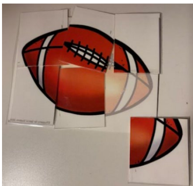
In this token economy, students add pieces to a football puzzle to earn rewards.

2. Choose Tokens: Tokens should be easy to give, collect, and track. They represent reinforcement but have no inherent value on their own.