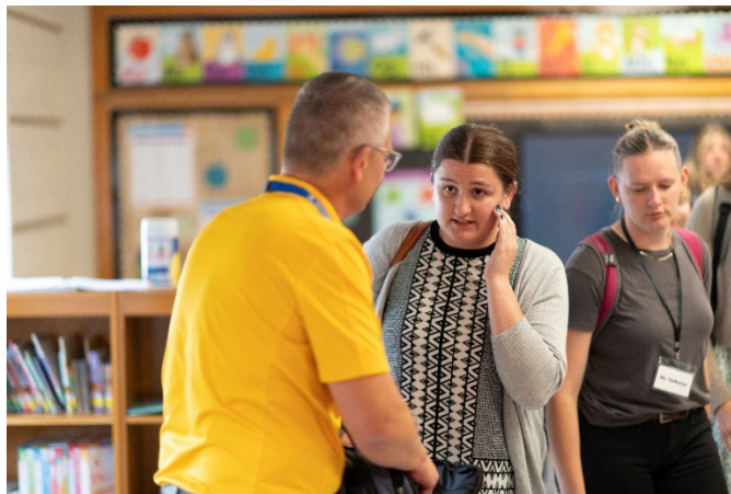
The 2x10 strategy is a relationship-building technique for teachers who talk with a specific student for two minutes each day for ten consecutive school days