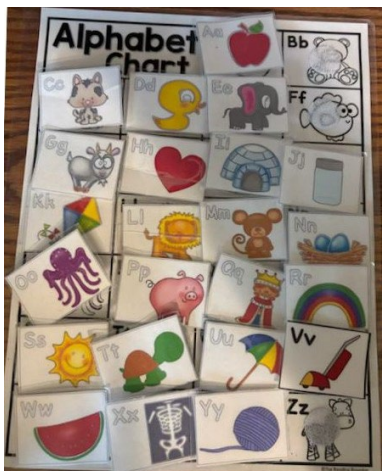
In this token economy, the student matches letters of the alphabet to a blank alphabet chart to earn rewards.

Brainstorm with the student to identify reinforcers that are motivating yet feasible to manage.