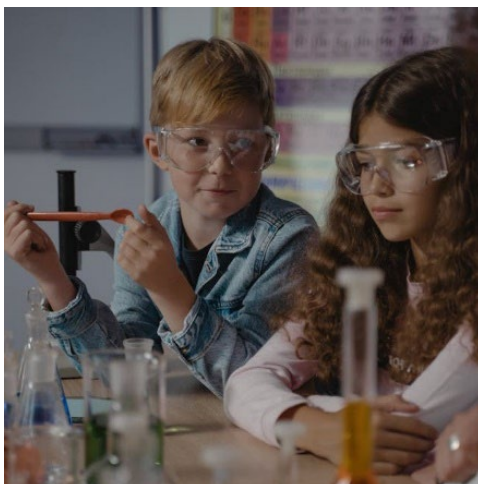
Some students struggle with peer disagreement. Frustration may lead to disruptive behavior.