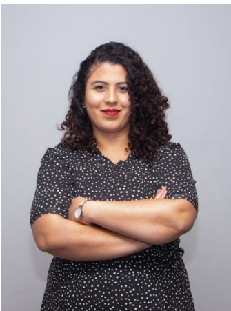
Hopeful optimism allows teachers to see the possibilities for all students and remain grounded in present realities.

An optimistic outlook is not about ignoring difficulties or pretending that challenges do not exist. Instead, it reflects a deliberate choice to notice potential and possibility alongside real obstacles. A balanced, hopeful stance allows teachers to remain grounded in present realities while maintaining confidence that growth and change are possible for every student. Research shows that people who intentionally practice optimism experience improvements in mood, greater resilience during stress, and a stronger sense of agency in shaping their circumstances.