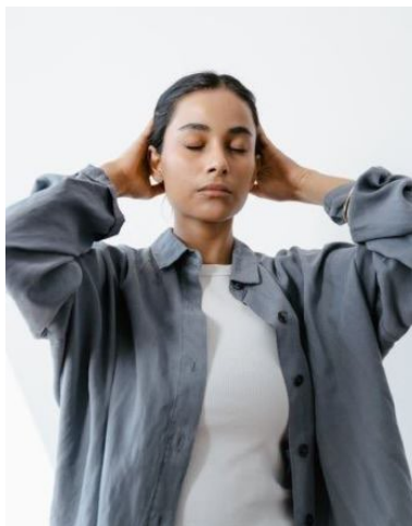
A teacher's calm presence can serve as an anchor for students in distress.