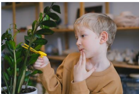
Strengths often lie behind difficult behaviors. For example, curious students frequently test the classroom limits.

A strengths-based approach shifts the focus from what students are doing wrong to what they are doing well. Instead of zeroing in on mistakes or misbehavior, teachers can look for reasons to celebrate students’ abilities, interests, and positive qualities. Often, strengths and struggles are two sides of the same coin. The same traits that make a student challenging in one situation may be what helps them thrive in another. It’s important to remember that some strengths don’t always fit neatly into the routines and expectations of a classroom, yet they are still valuable traits that can be nurtured and redirected toward growth.