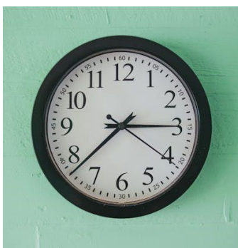
A JONAH Room should have minimal distractions and a visible clock.

The JONAH Room should be a quiet space with minimal distractions and a supervising adult present at all times. The purpose of the space is to provide a brief, neutral reset