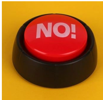
The No! button symbolizes “won’t do”, rather than a “can’t do”, problem. Image: Ann H. (2024, April 12). Red button on bright yellow background . Pexels.com (CC free to use)

Misbehavior offers important information for teachers. It signals that the student needs more support, direct teaching, or more reinforcement of appropriate behaviors. When misbehavior occurs, teachers can respond with both correction and consequences.