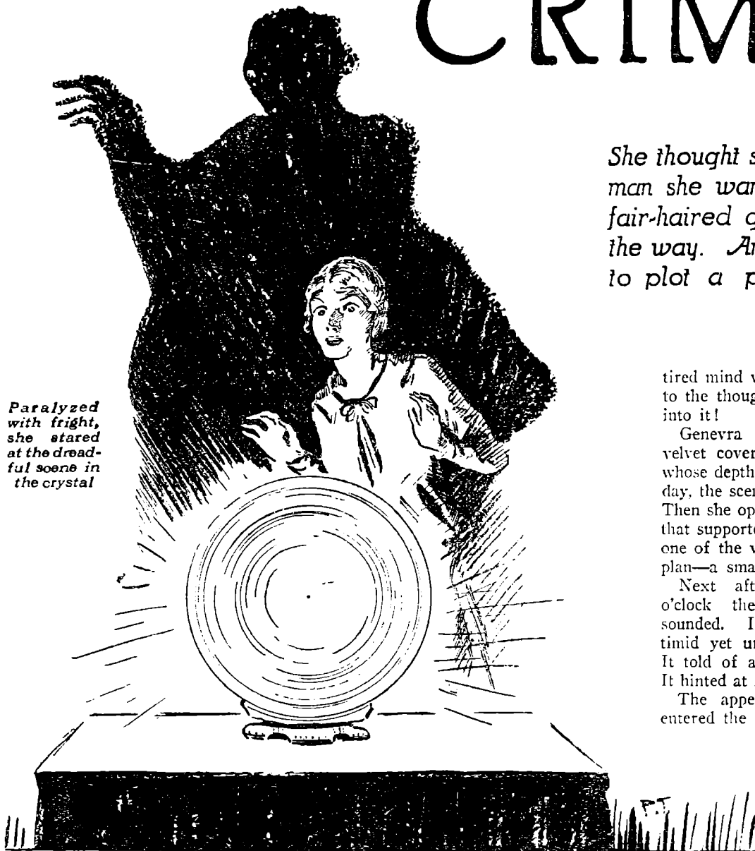
Paralyzed with fright, she stared at the dreadful scene in the crystal

She thought she could win the man she wanted—if only the fair-haired girl were out of the way. And so she dared to plot a psychic murder!